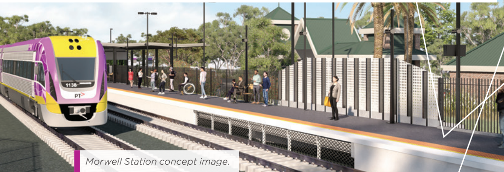
Morwell Station concept image.