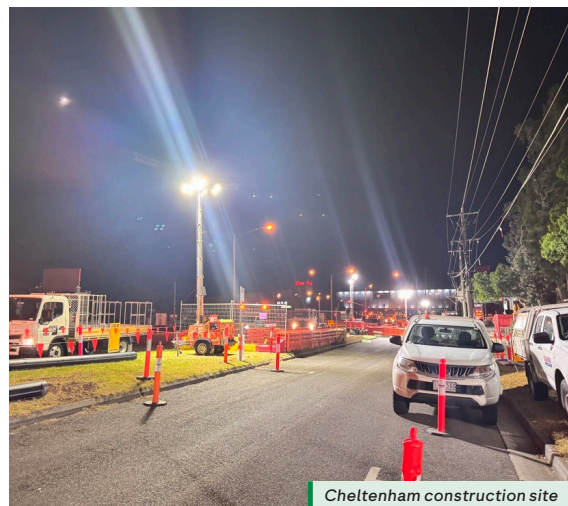
Cheltenham construction site