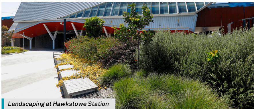
Landscaping at Hawkstowe Station