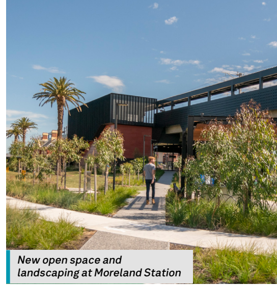
New open space and landscaping at Moreland Station

When the project is complete, we will plant more than 100,000 new trees, plants and shrubs along the rail corridor and in the new open space.