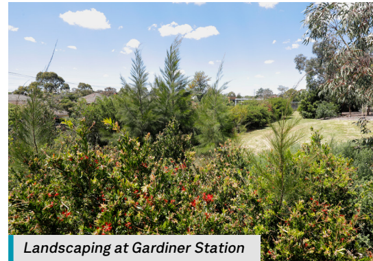
Landscaping at Gardiner Station