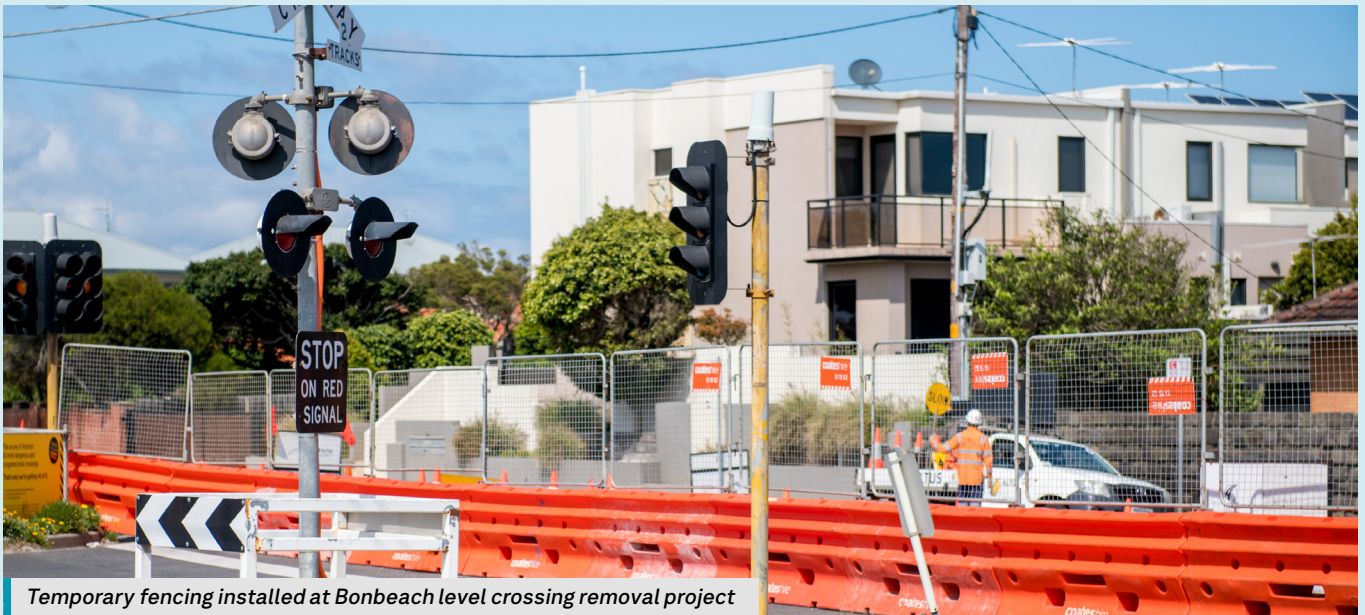
Temporary fencing installed at Bonbeach level crossing removal project

Residents and businesses in the local area will receive more details ahead of any works.