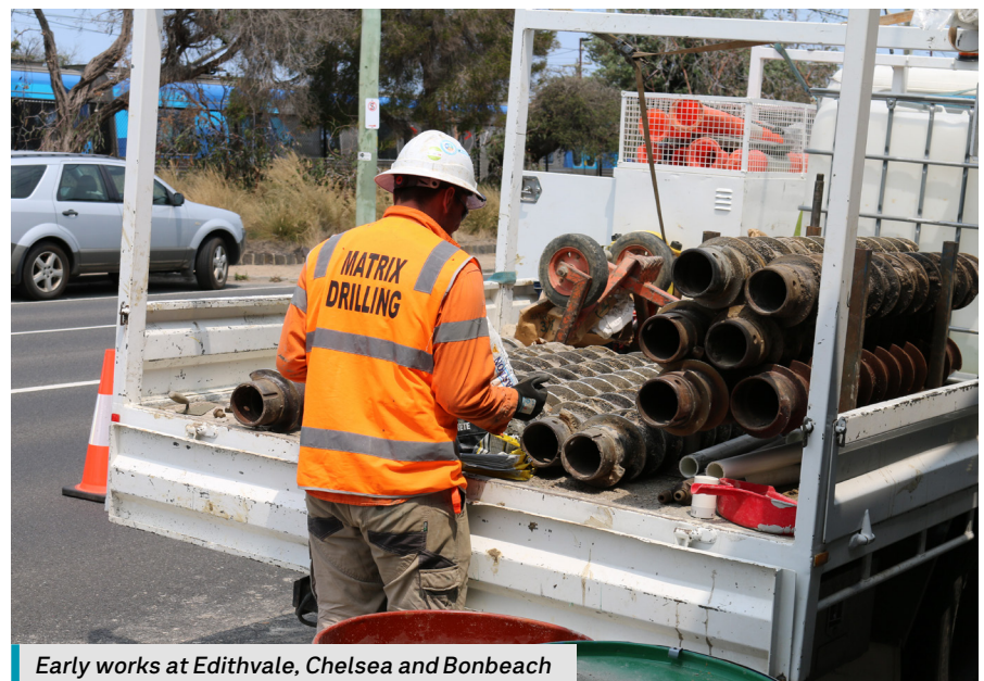
Early works at Edithvale, Chelsea and Bonbeach