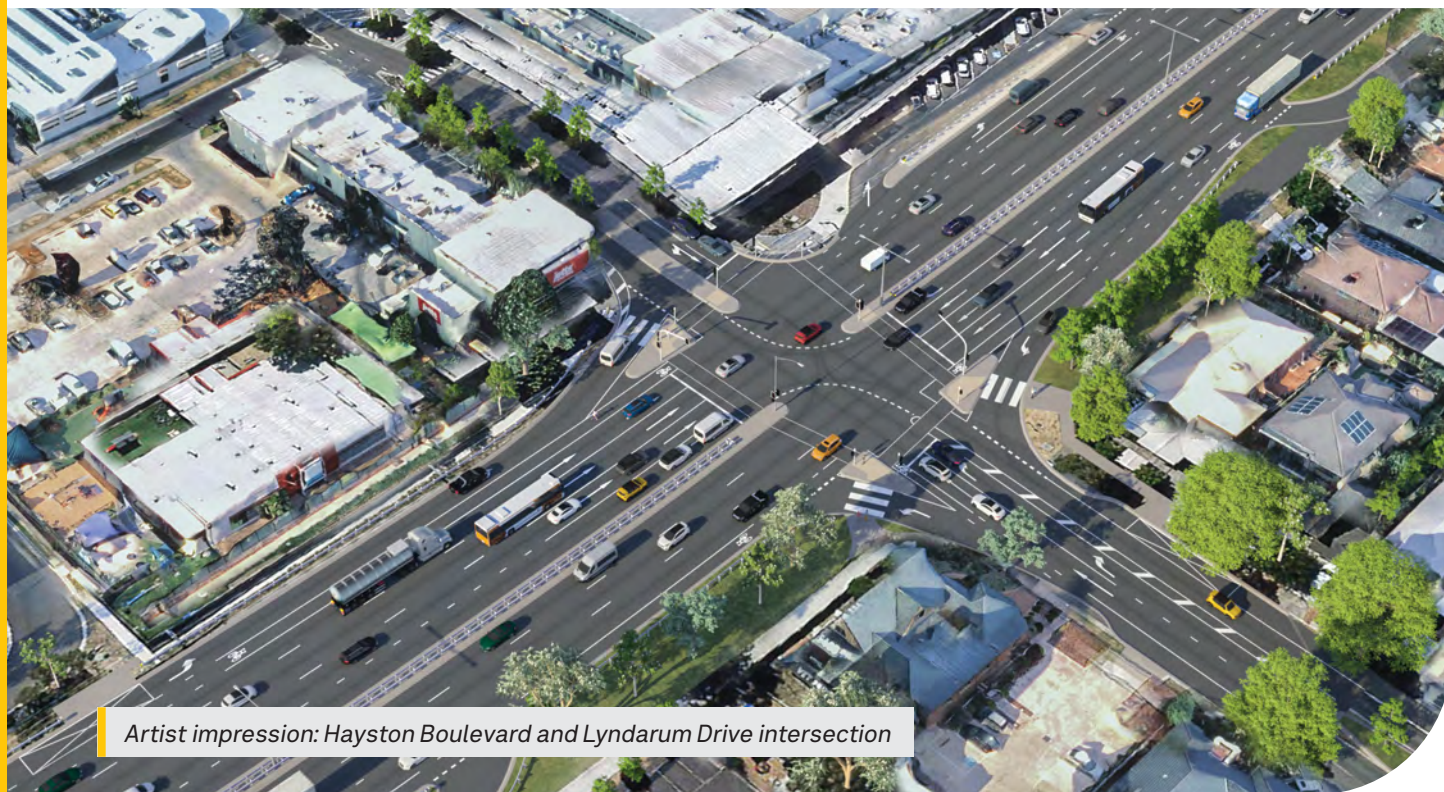
Artist impression: Hayston Boulevard and Lyndarum Drive intersection