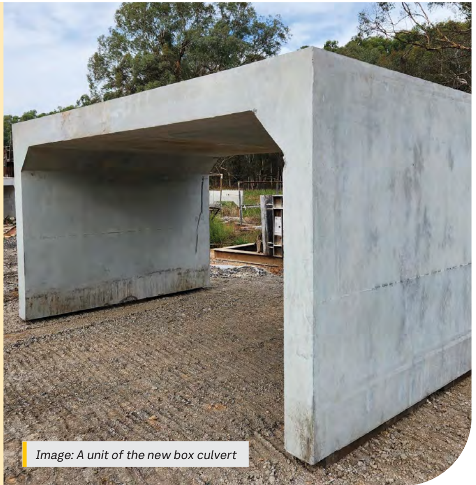
Image: A unit of the new box culvert

The culverts we're installing are up to 45 metres long, 16 metres wide and 2 metres high.