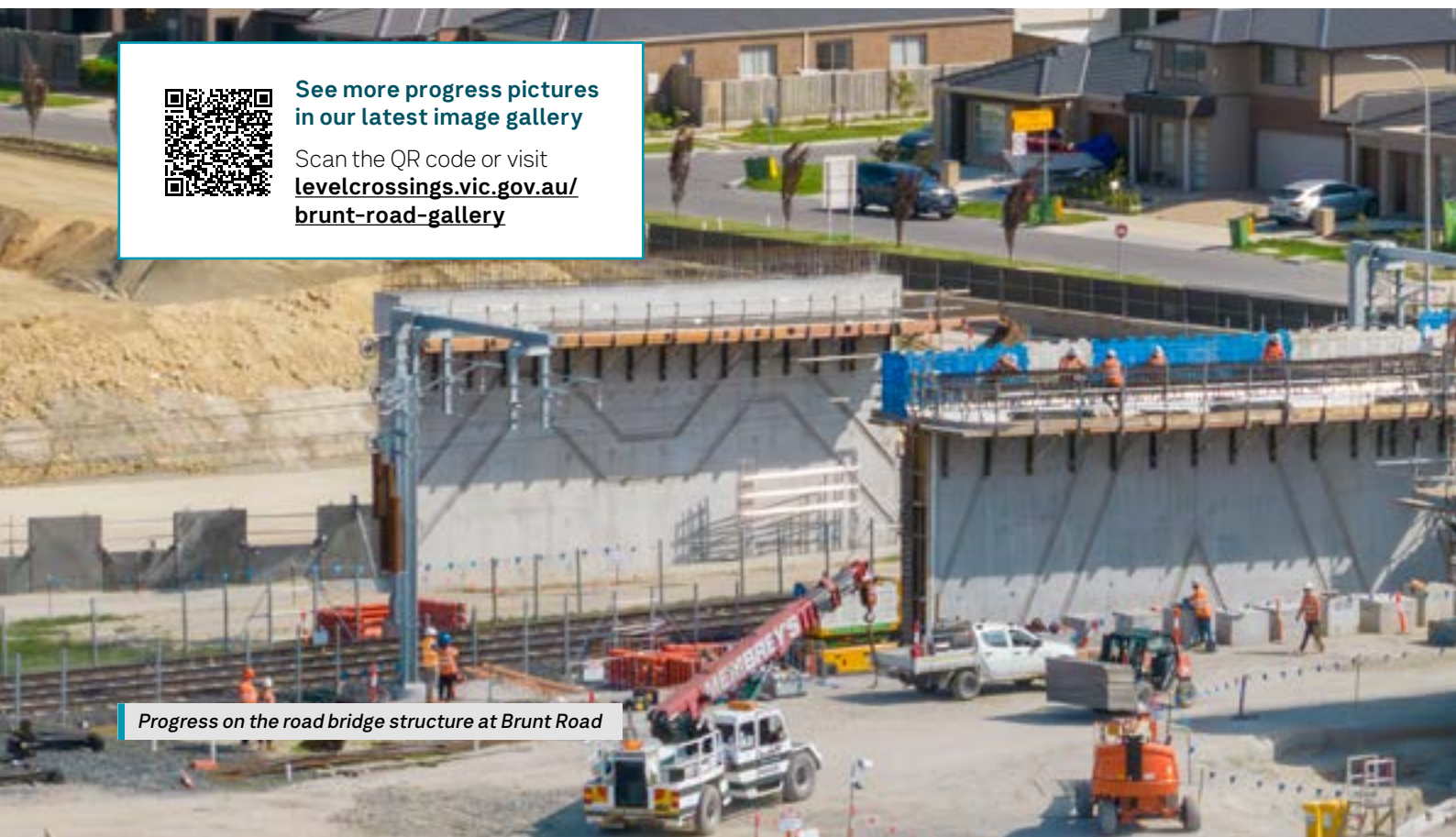
Progress on the road bridge structure at Brunt Road

Scan the QR code or visit levelcrossings.vic.gov.au/brunt-road-gallery