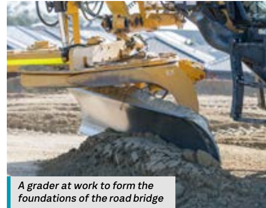
A grader at work to form the foundations of the road bridge