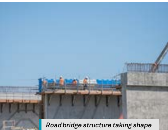
Road bridge structure taking shape