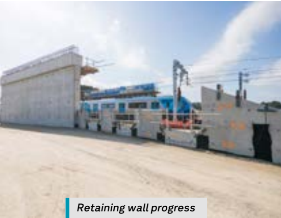
Retaining wall progress

The retaining wall will be made up of 160 panels, which will range from 1m to 9.5m in height.