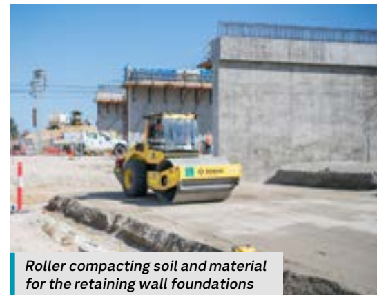
Roller compacting soil and material for the retaining wall foundations