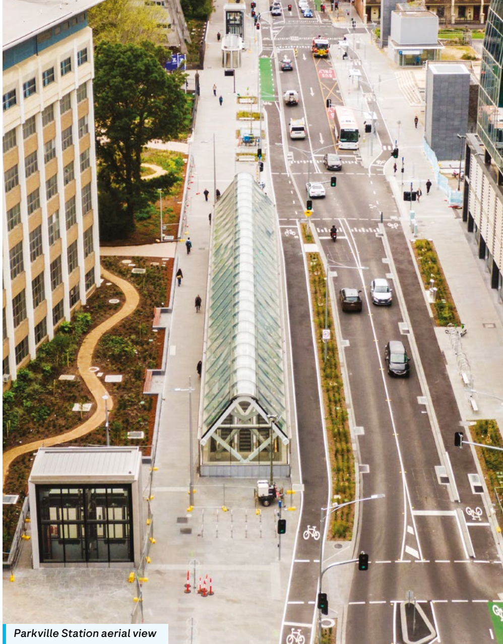
Parkville Station aerial view

Parkville Station will have Victorian-first platform screen doors for better safety, climate control and less noise.