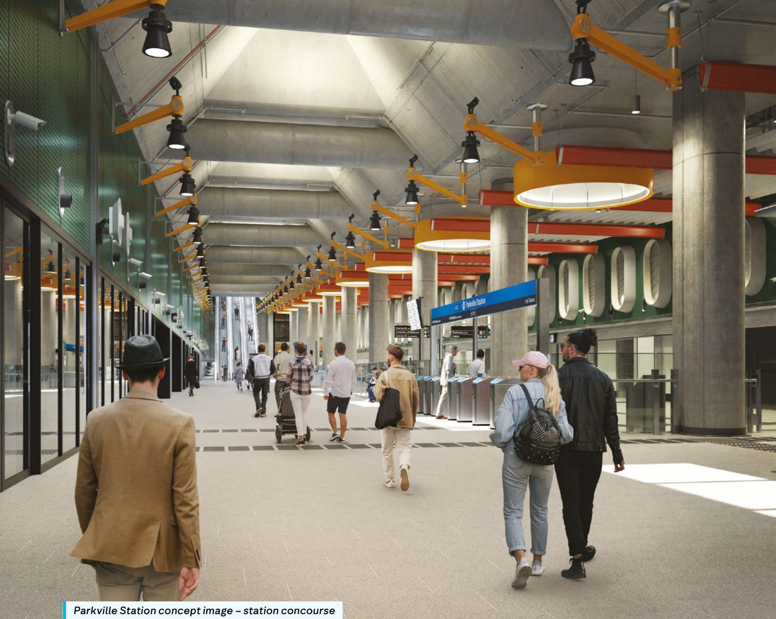
Parkville Station concept image – station concourse