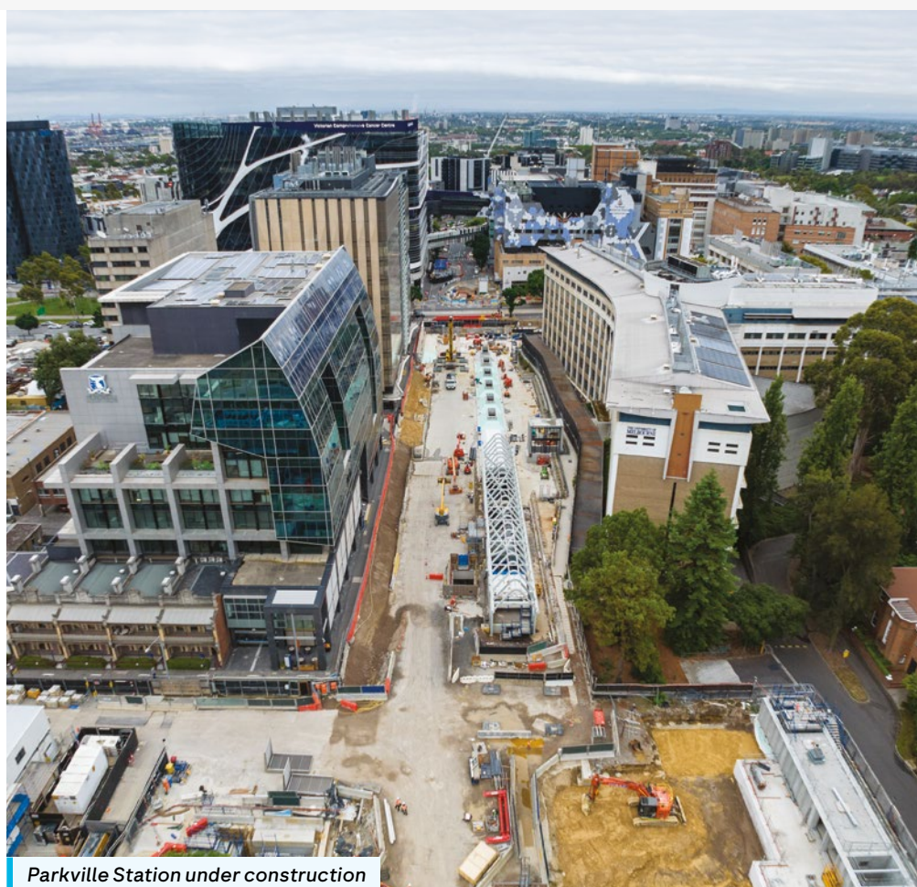
Parkville Station under construction

Next-generation High Capacity Signalling for turn up and go services