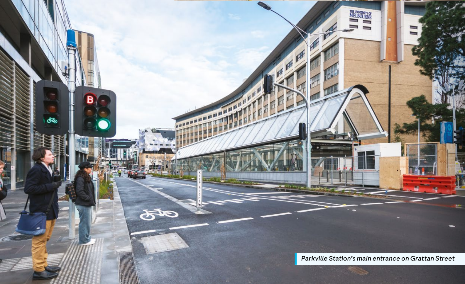
Parkville Station's main entrance on Grattan Street