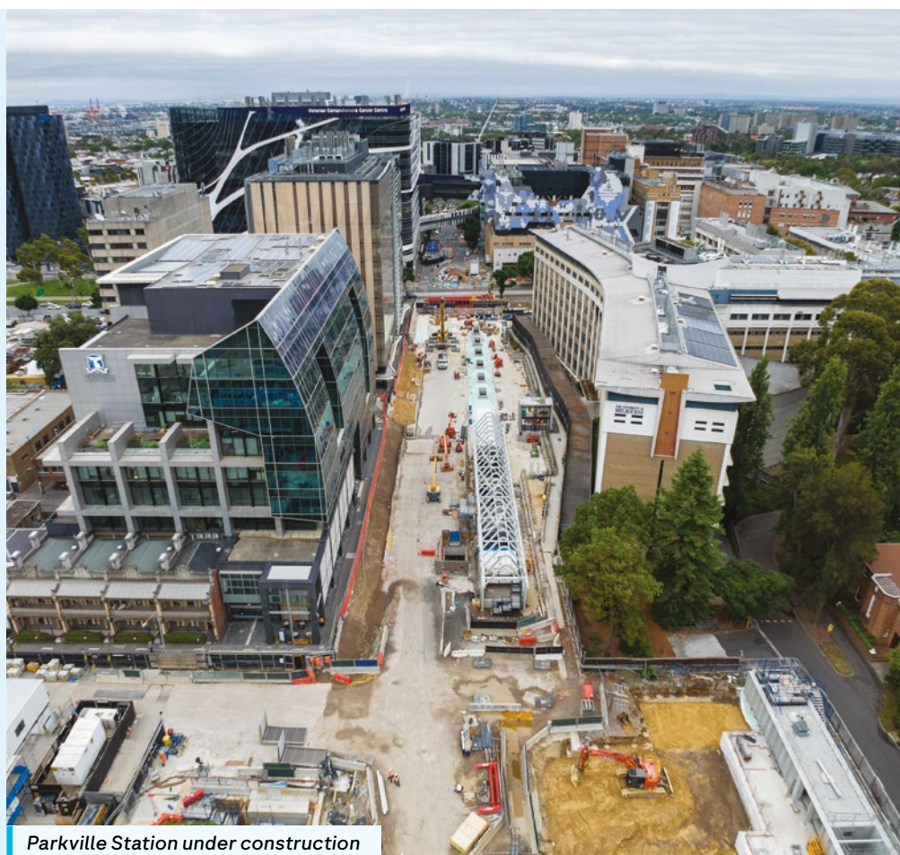
Parkville Station under construction

Next-generation High Capacity Signalling for turn up and go services