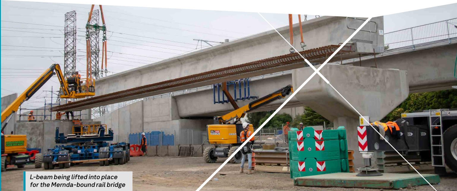
L-beam being lifted into place for the Mernda-bound rail bridge

Works are continuing to remove the dangerous and congested level crossing at Keon Parade and build a new Keon Park Station.