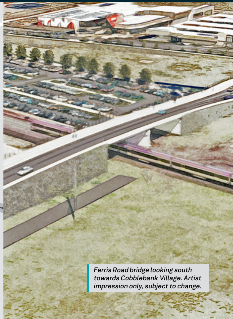
Ferris Road bridge looking south towards Cobblebank Village. Artist impression only, subject to change.