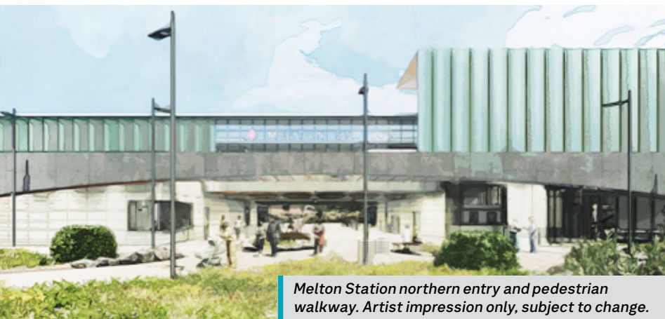
Melton Station northern entry and pedestrian walkway. Artist impression only, subject to change.

Check out concept designs of the new Melton Station and the rail bridges over Coburns and Exford roads at levelcrossings.vic.gov.au/projects/melton