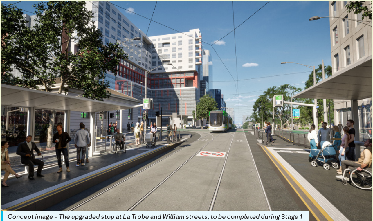
Concept image - The upgraded stop at La Trobe and William streets, to be completed during Stage 1

There will be changes to how motorists, cyclists and tram passengers travel during these works. For more information, visit yarratrams.com.au/projects