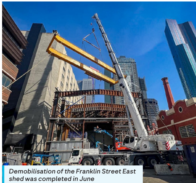
Demobilisation of the Franklin Street East shed was completed in June

24 hour works are sometimes required during peak construction activities