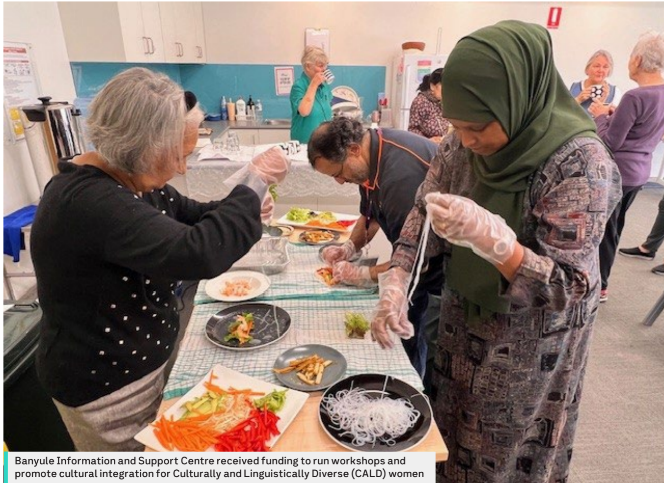
Banyule Information and Support Centre received funding to run workshops and promote cultural integration for Culturally and Linguistically Diverse (CALD) women