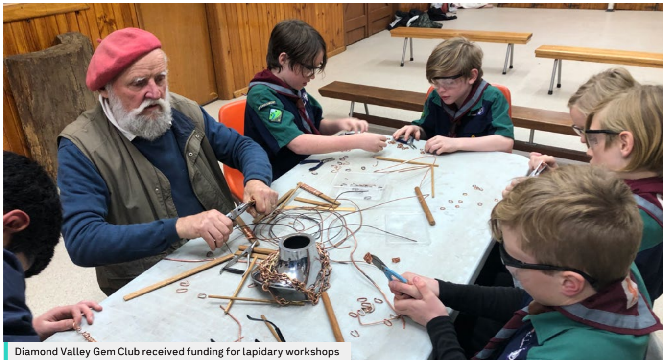
Diamond Valley Gem Club received funding for lapidary workshops

We would strongly encourage community groups and organisations to put forward applications for projects that will generate the most community benefit.