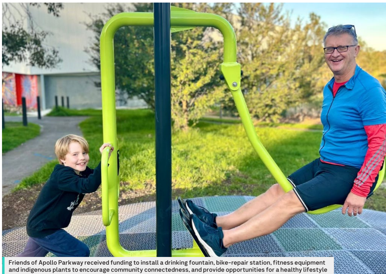
Friends of Apollo Parkway received funding to install a drinking fountain, bike-repair station, fitness equipment and indigenous plants to encourage community connectedness, and provide opportunities for a healthy lifestyle