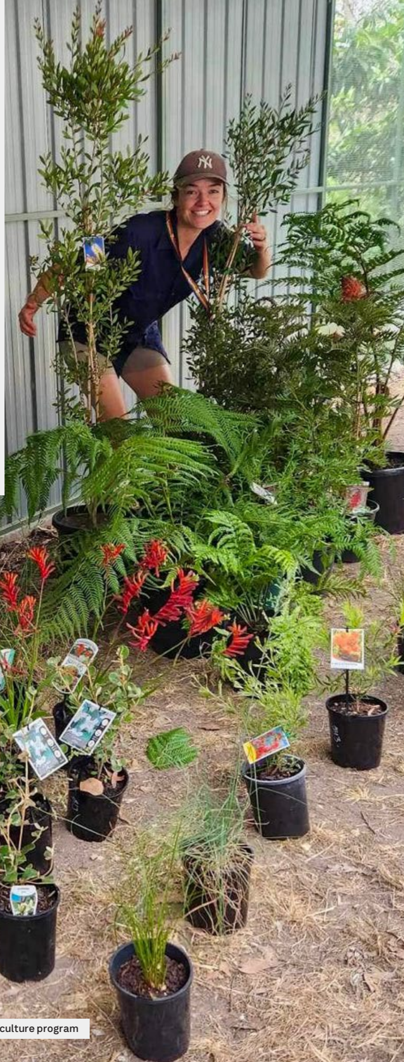
Templestowe College received funding for a community permaculture program

MRPV reserves the right, in its absolute discretion, to accept or reject any project proposal that is lodged after the closing date and/or not lodged in accordance with the requirements of the North East Community Fund guidelines (this document).