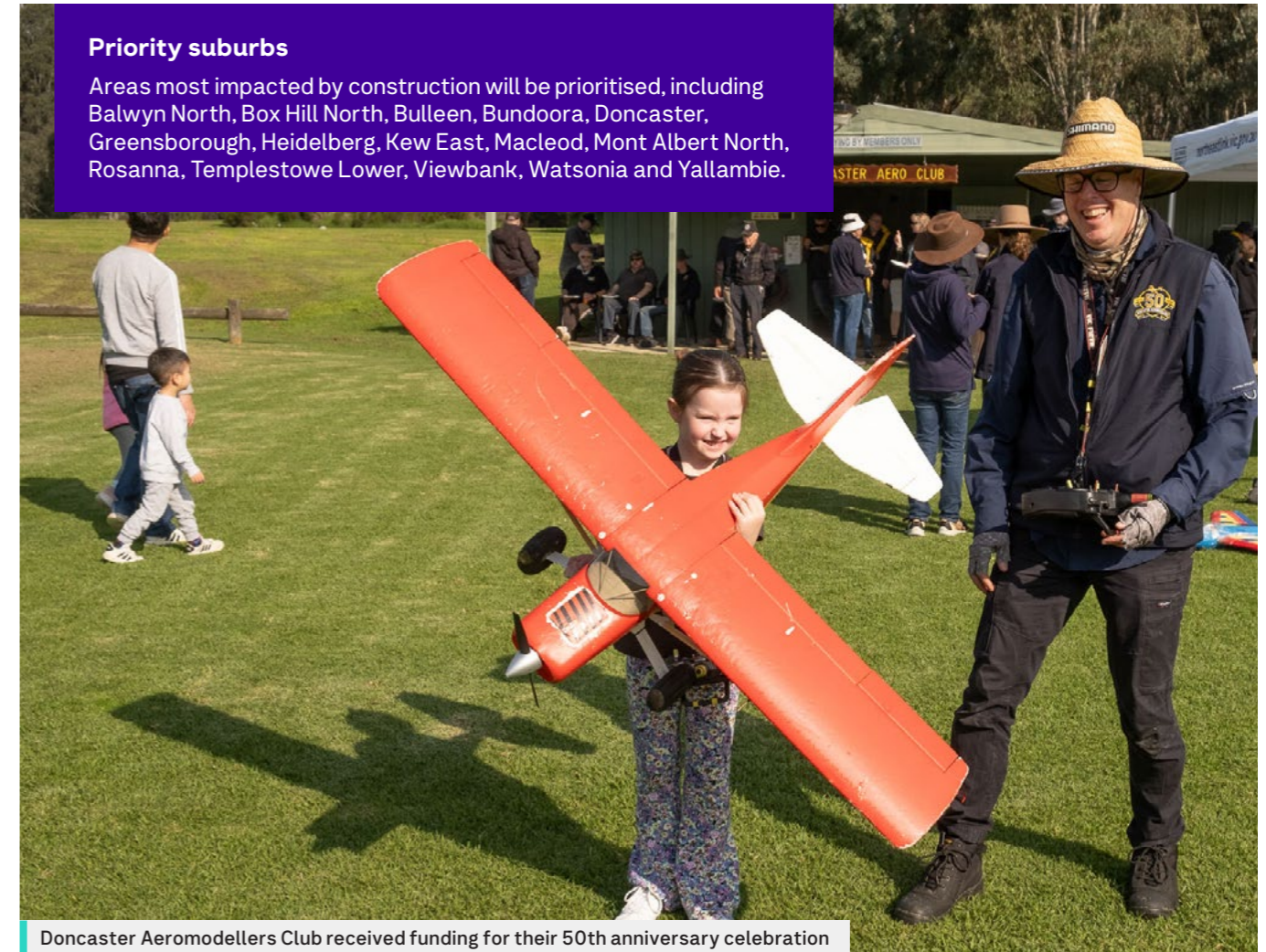
Doncaster Aeromodellers Club received funding for their 50th anniversary celebration

Areas most impacted by construction will be prioritised, including Balwyn North, Box Hill North, Bulleen, Bundoora, Doncaster, Greensborough, Heidelberg, Kew East, Macleod, Mont Albert North, Rosanna, Templestowe Lower, Viewbank, Watsonia and Yallambie.