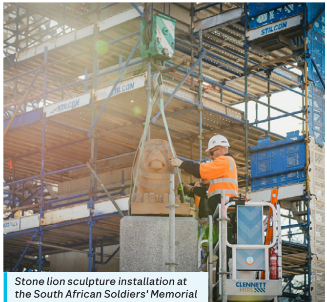
Stone lion sculpture installation at the South African Soldiers' Memorial

24 hour works are sometimes required during peak construction activities