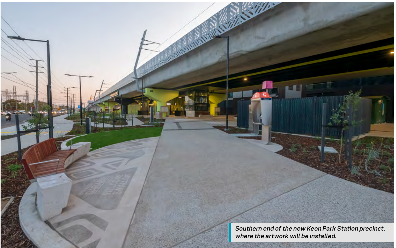
Southern end of the new Keon Park Station precinct, where the artwork will be installed.