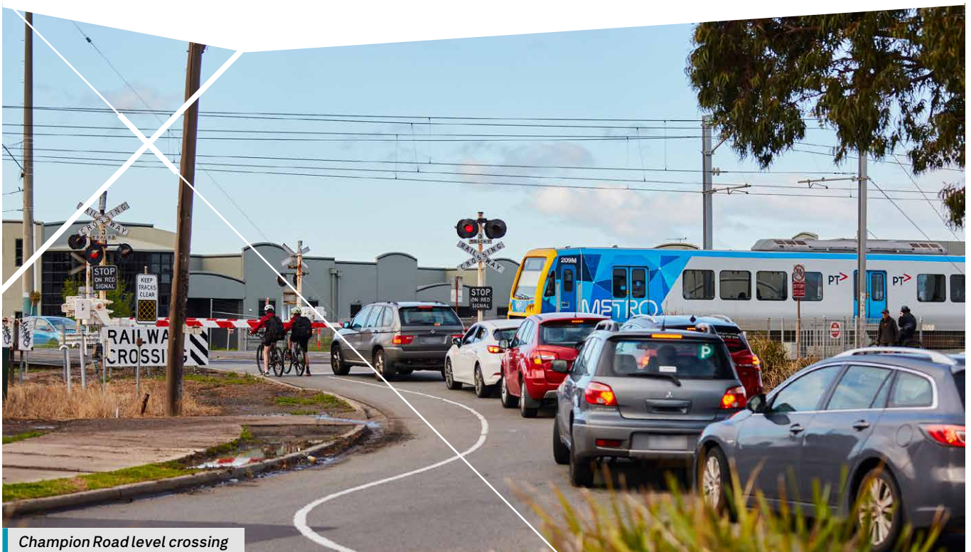
Champion Road level crossing

Making Melbourne's busiest train lines level crossing free to improve journey times and service reliability across the network