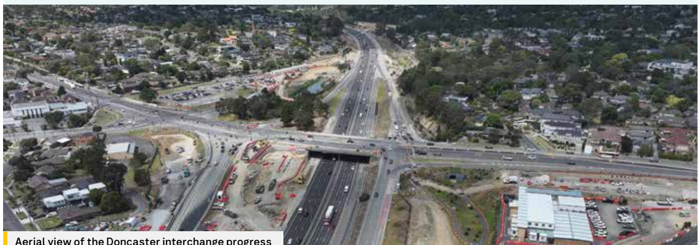
Aerial view of the Doncaster interchange progress

We're getting close to opening two of the four temporary freeway ramps, with construction to begin on the remaining two in mid to late 2025.