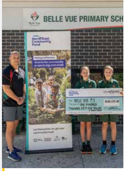
Belle Vue Primary School will be resurfacing the school basketball court

Applications close 3pm Tuesday 29 April 2025