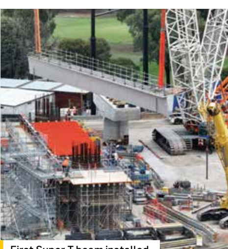
First Super T beam installed

In mid 2025, we'll move traffic onto the new Bulleen Road bridge, north of the freeway, opening up areas for works to begin on the flyover structures.