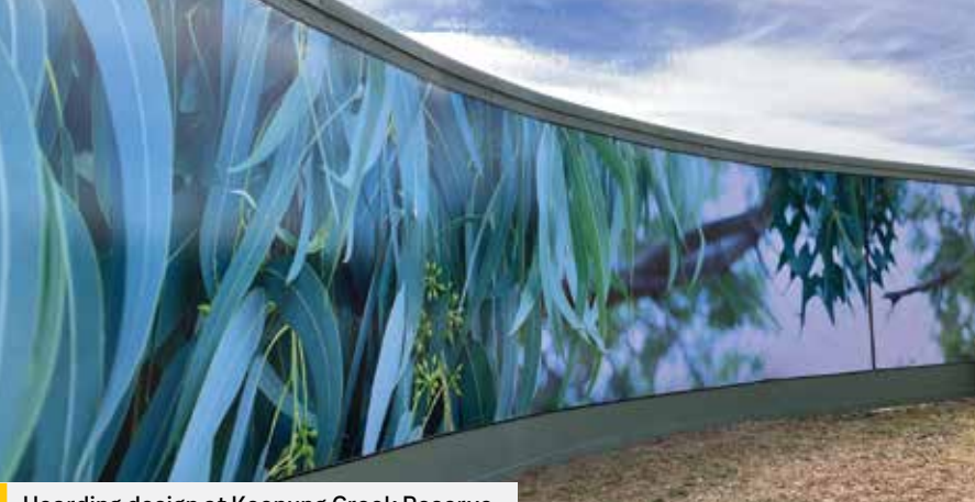
Hoarding design at Koonung Creek Reserve

To see the latest information on upcoming disruptions please visit Victoria's Big Build.