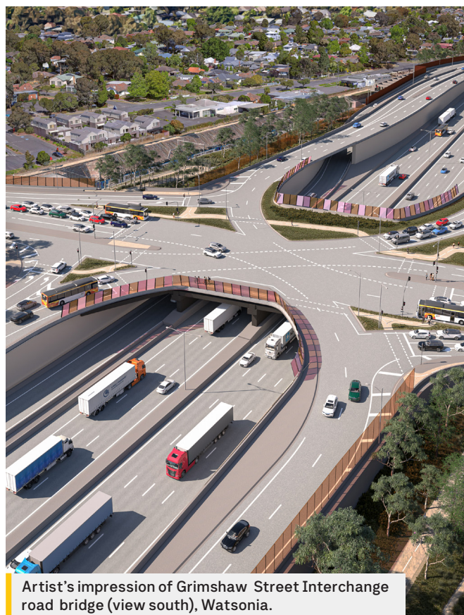
Artist's impression of Grimshaw Street Interchange road bridge (view south), Watsonia.

Schedule is subject to change. Visit bigbuild.vic.gov.au/disruptions for the latest information on traffic disruptions. For more information call 1800 105 105 or visit the Hub at 17 Watsonia Road, Watsonia .