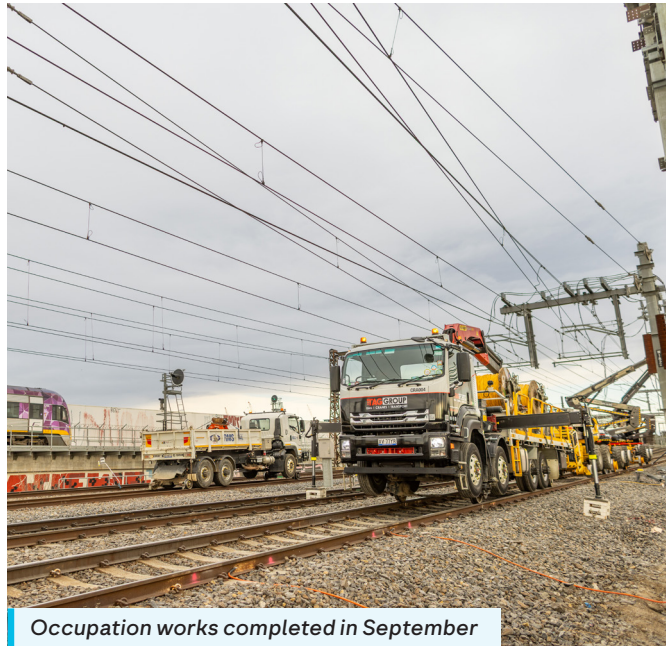
Occupation works completed in September

24 hour works are sometimes required during peak construction activities We will notify if out of hours works are required