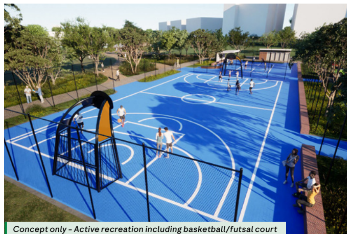
Concept only - Active recreation including basketball/futsal court