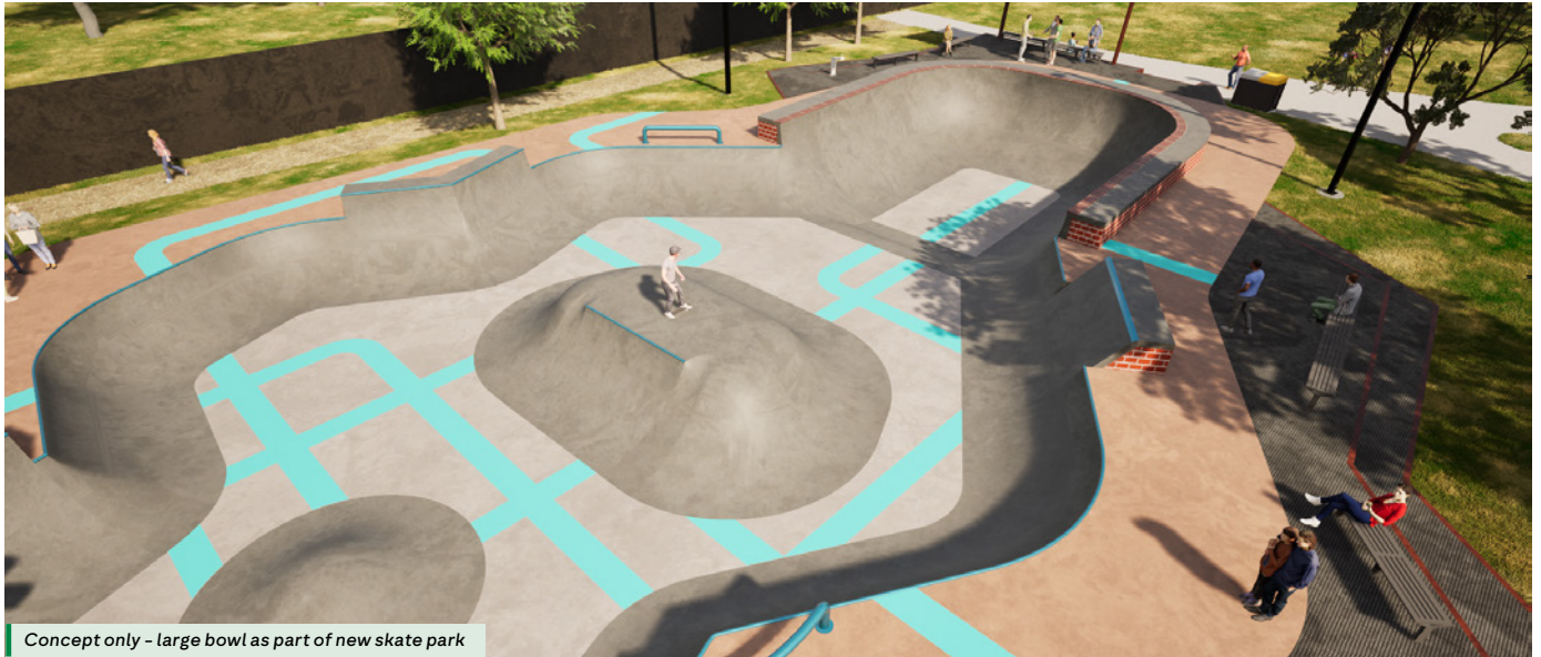
Concept only - large bowl as part of new skate park