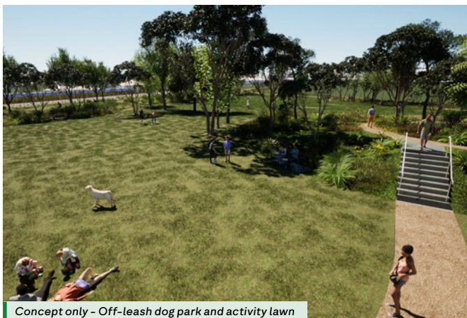
Concept only - Off-leash dog park and activity lawn

You can read a summary of the community and stakeholder feedback we received on the early design for the new and improved open space at Sir William Fry Reserve, and how it has been incorporated into the design at suburbanrailloop.vic.gov.au/have-your-say