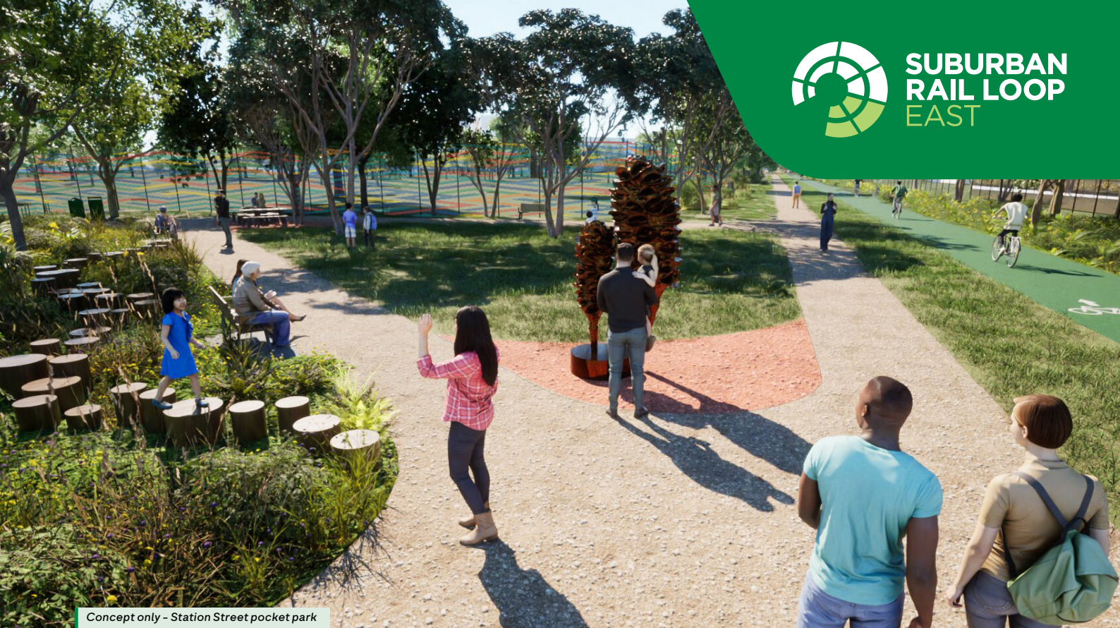
Concept only - Station Street pocket park