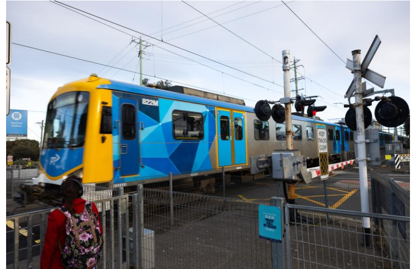
Boom gates down at the Station Street level crossing

Seven near misses near misses at these crossings since 2016.