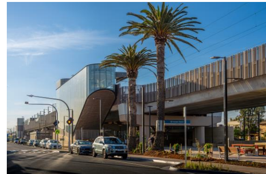
The new elevated Carrum and Parkdale stations