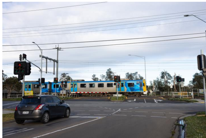
Boom gates down at the Armstrongs Road level crossing