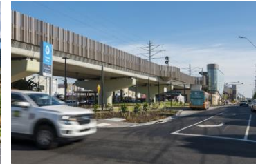
Clockwise from top: Rail bridges in Carrum, Parkdale and the elevated Moreland Station