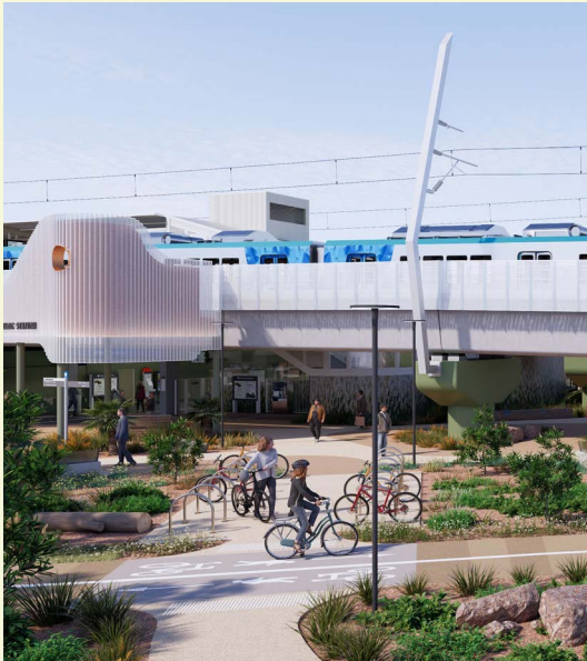
The station forecourt looking towards Albert Street, with the new walking and cycling path, bike hoops and landscaping.

The station forecourt will feature raised garden beds, seating, and landscaped areas, creating a vibrant and open space. We'll plant 85,000 plants, shrubs and grasses as part of the project.