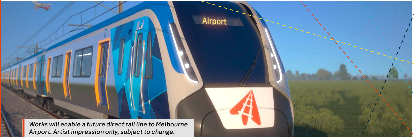
Works will enable a future direct rail line to Melbourne Airport. Artist impression only, subject to change.

The first stage of Melbourne Airport Rail will soon kick off, with the Australian and Victorian governments investing in major changes to the rail network around Sunshine Station to enable a new rail line to the airport and support the growth of Melbourne's booming west.