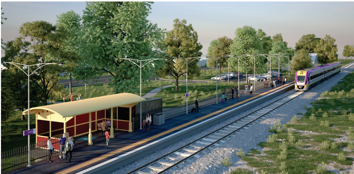
Concept image — Goornong Station

Lighting and CCTV will provide station users with added security.