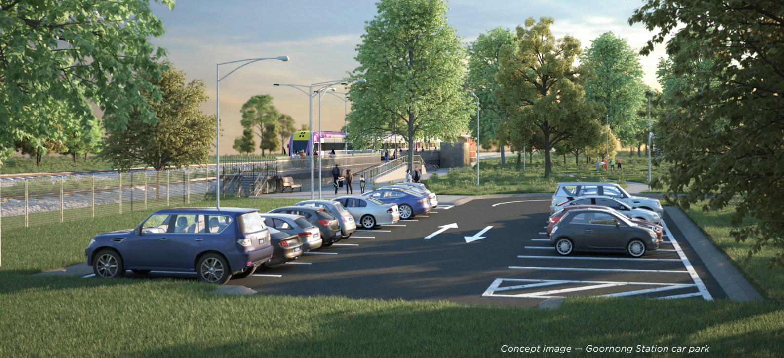
Concept image — Goornong Station car park