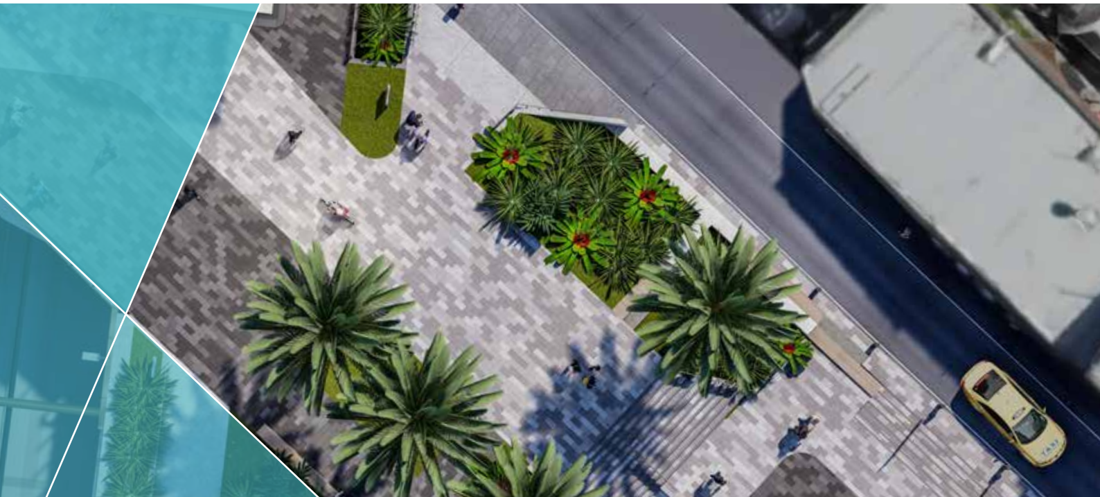
There will be footpath improvements and modern seating at the new Cheltenham Station. Artist impression only. Subject to change.