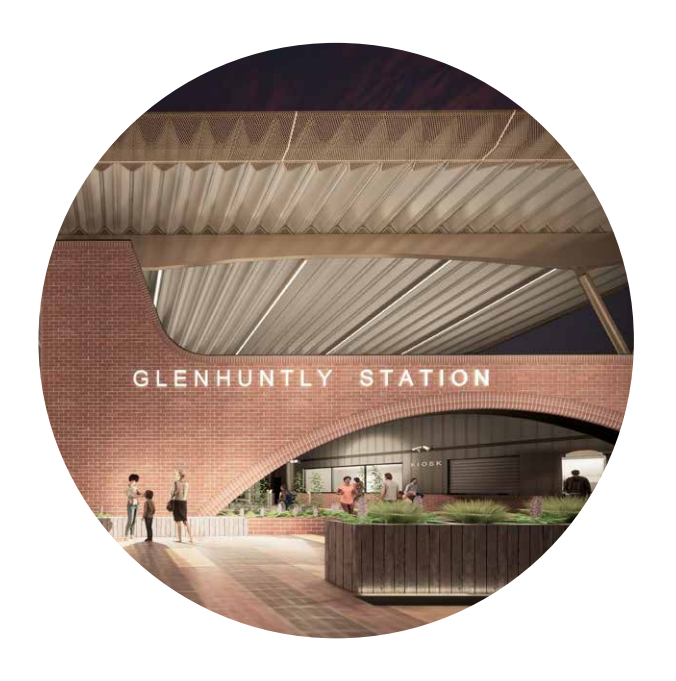
The new Glenhuntly Station. Artist impression, subject to change.

Careful planning has been undertaken by qualified arborists and sustainability and environmental specialists to help minimise the impacts to local flora and fauna.