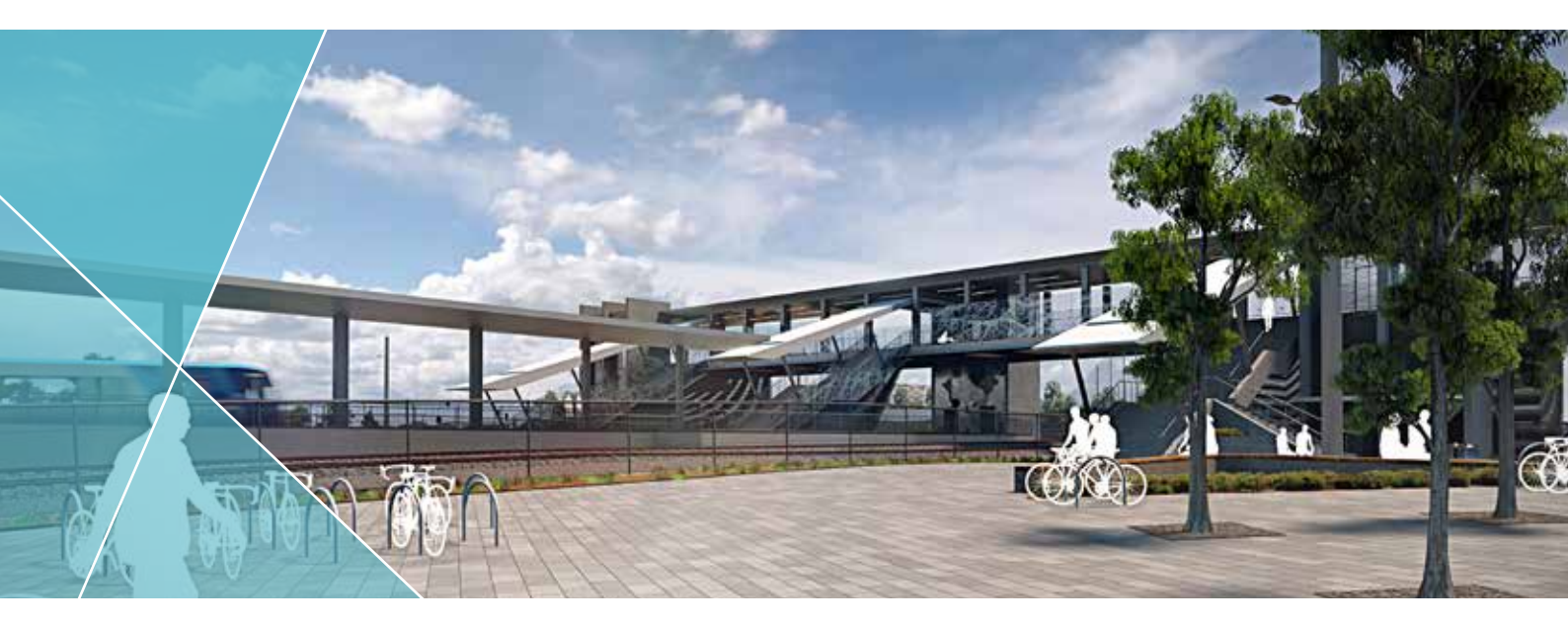
New northern plaza at Hoppers Crossing Station with pedestrian and cyclist overpass. Artist impression only. Subject to change.