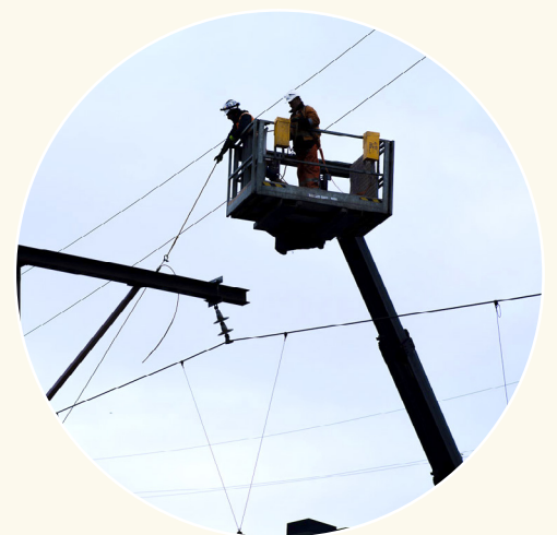
Crews removing high voltage wires