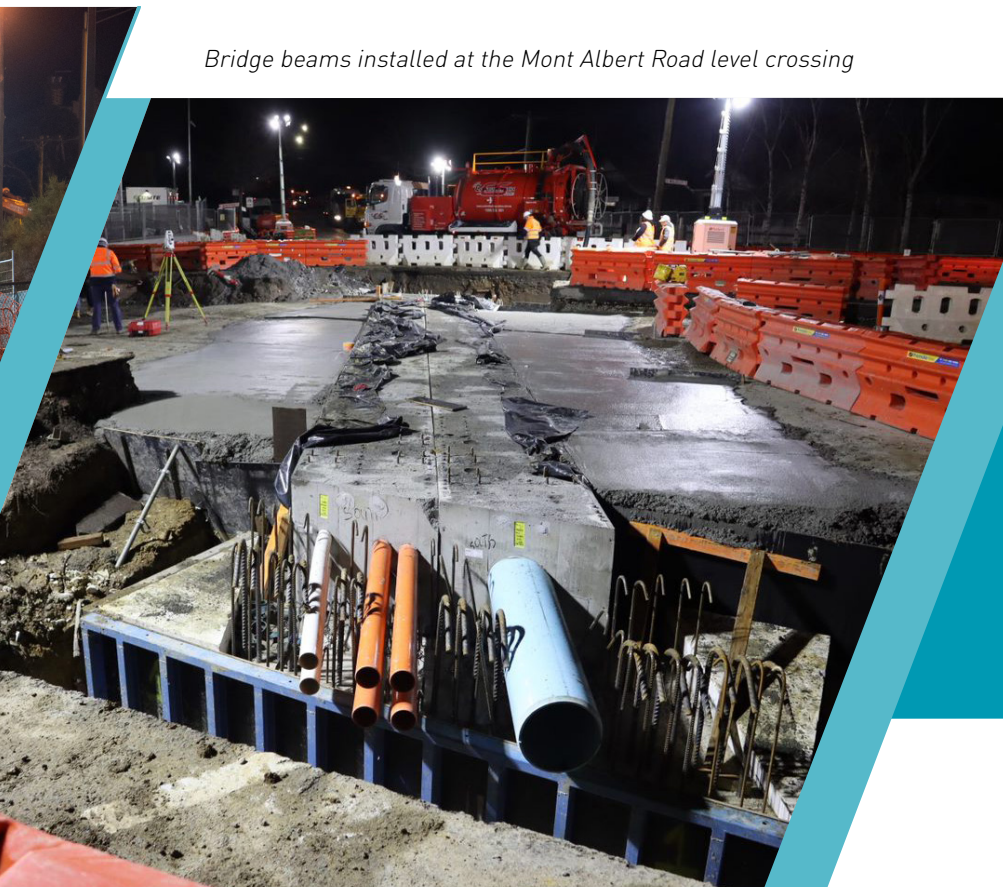
Bridge beams installed at the Mont Albert Road level crossing

To stay up to date with upcoming works scan the QR code or visit bigbuild.vic.gov.au/disruptions/mont-albert-disruptions