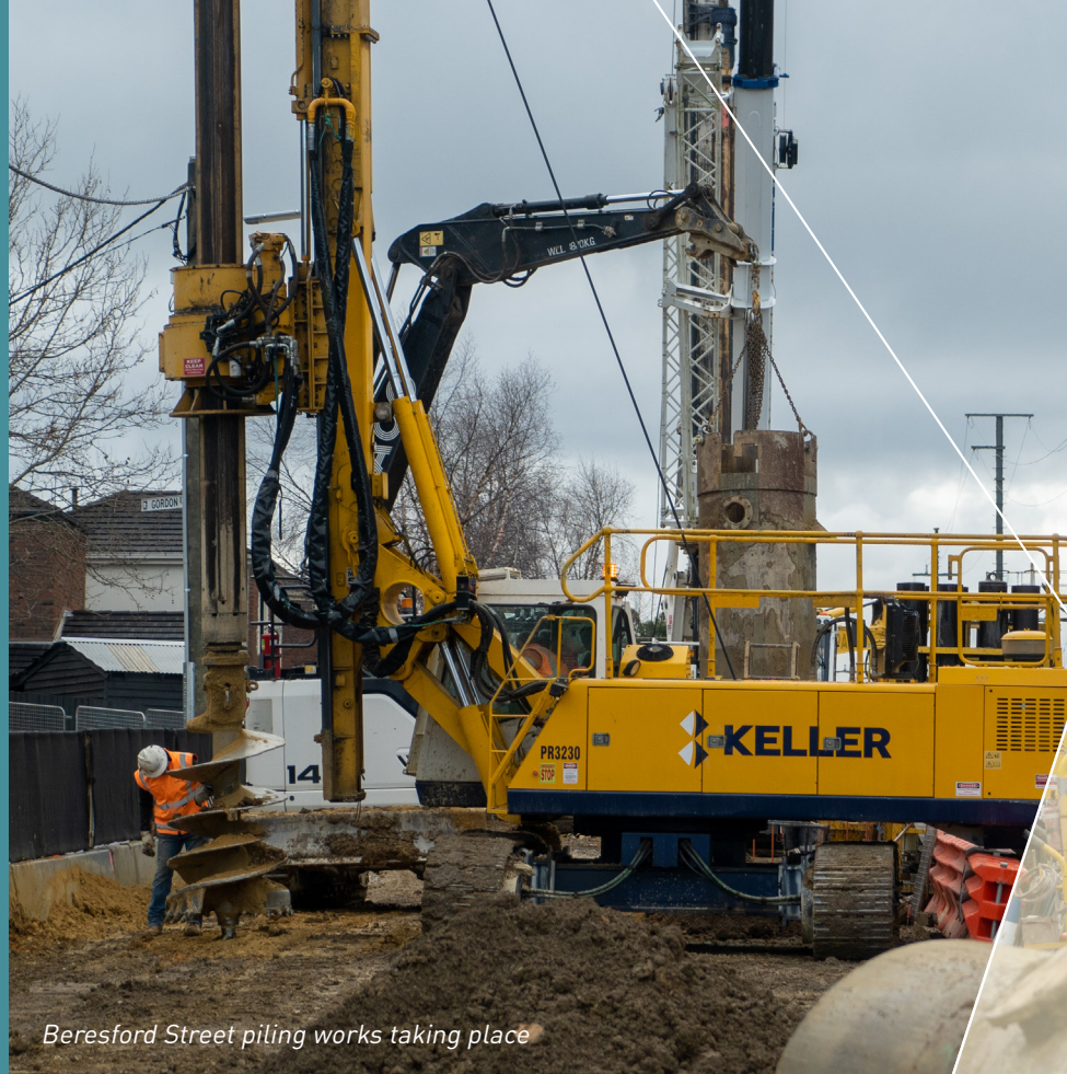
Beresford Street piling works taking place

250,000 passengers transported via replacement buses