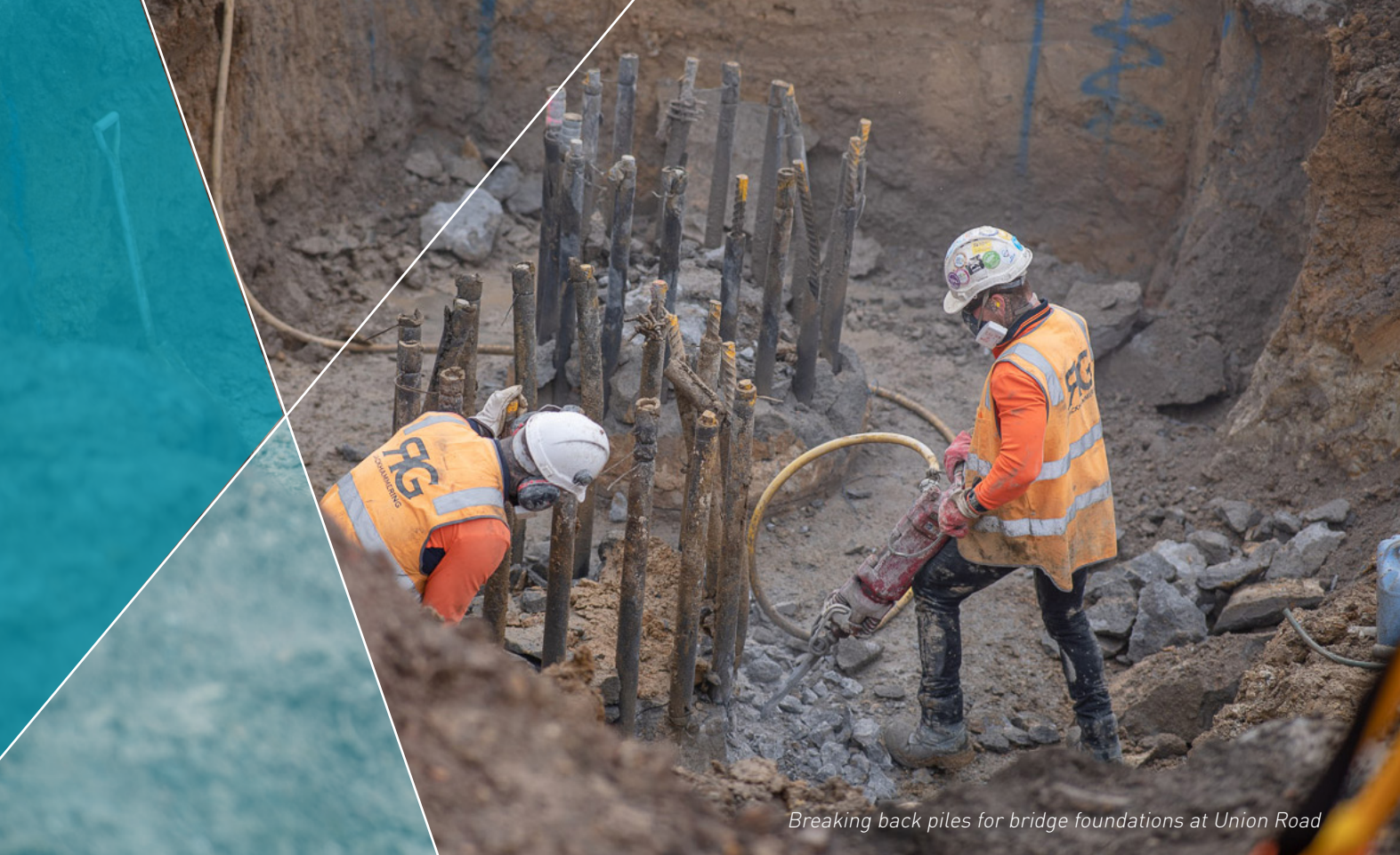
Breaking back piles for bridge foundations at Union Road