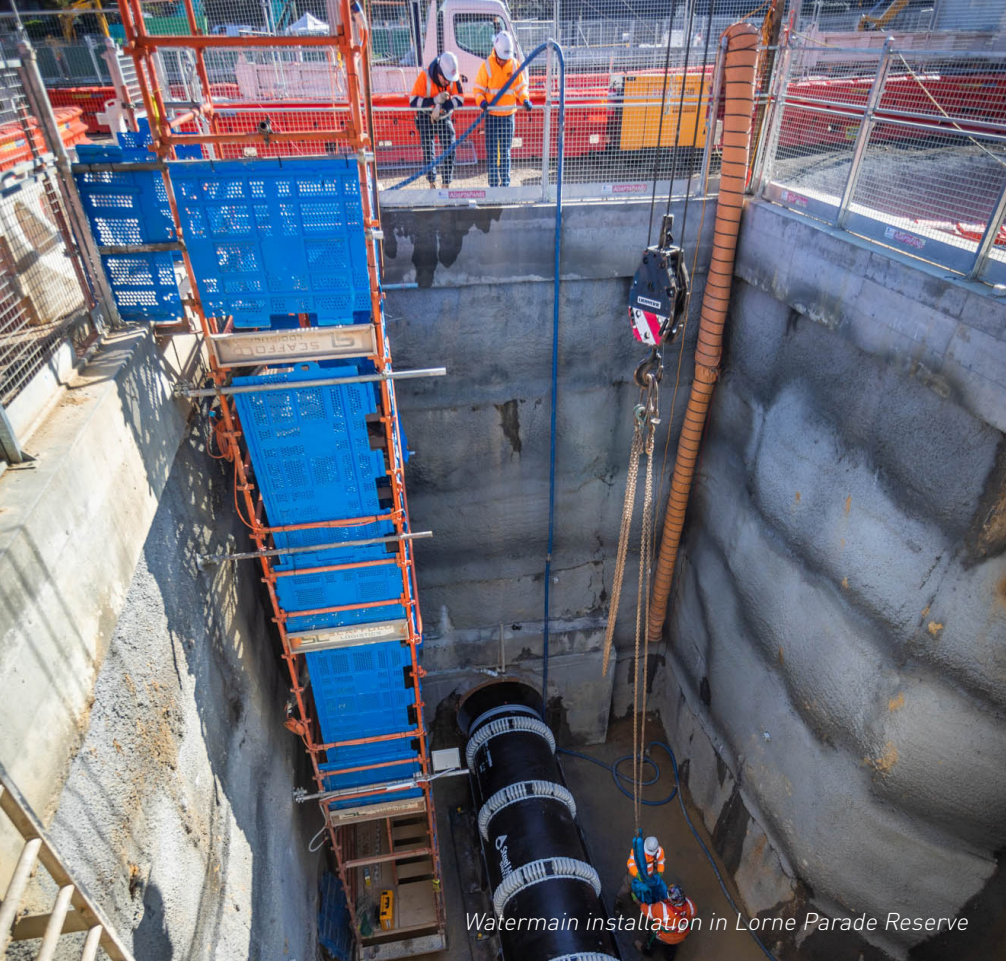
Watermain installation in Lorne Parade Reserve