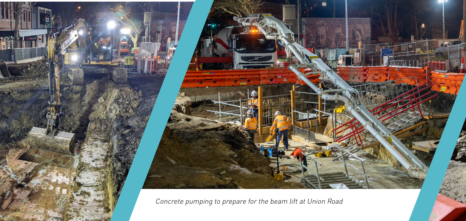
Concrete pumping to prepare for the beam lift at Union Road

Excavating in preparation for bridge support installation at Union Road