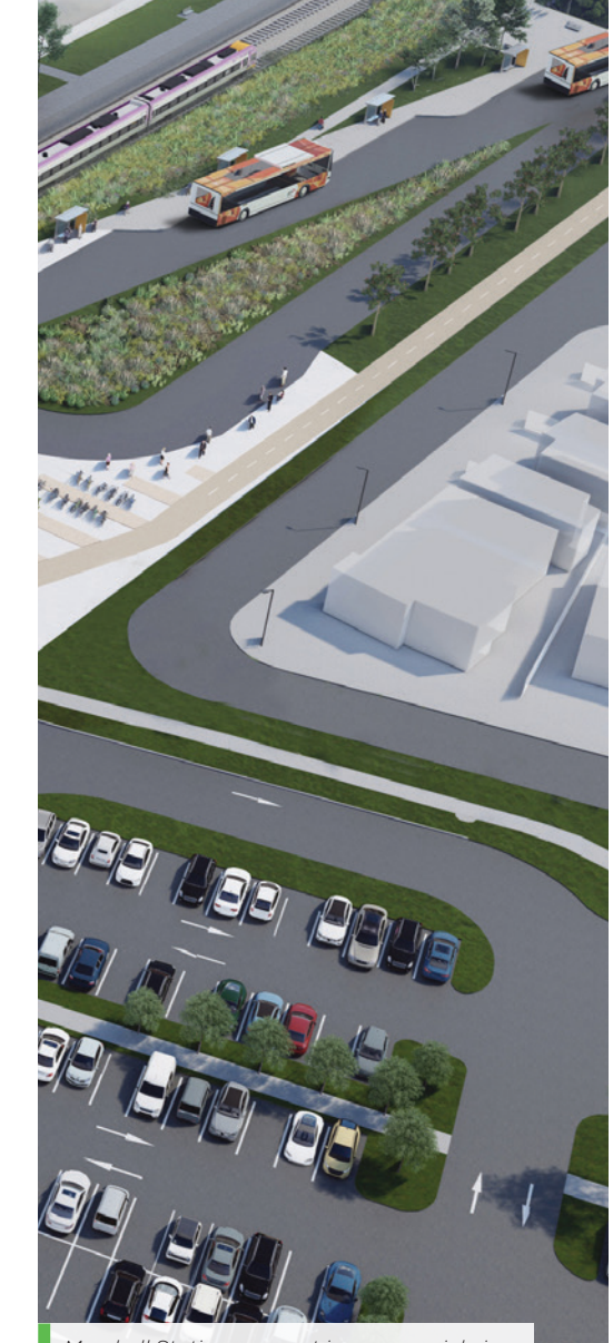
Marshall Station concept image - aerial view

We have engaged the Wadawurring Traditional Owners Aboriginal Corporation and City of Greater Geelong to develop the landscaping plans and to seek advice on climate resilient planting.