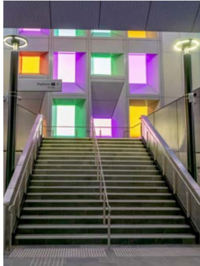
Bell Station stairs to platforms

We hope everyone has had a chance to check out your new stations at Bell and Preston. If you haven't managed to get there yet, check out these photos.