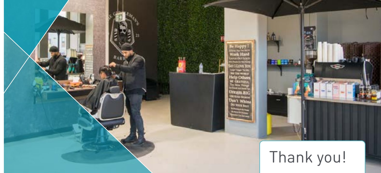
The Gentleman's Barbershop