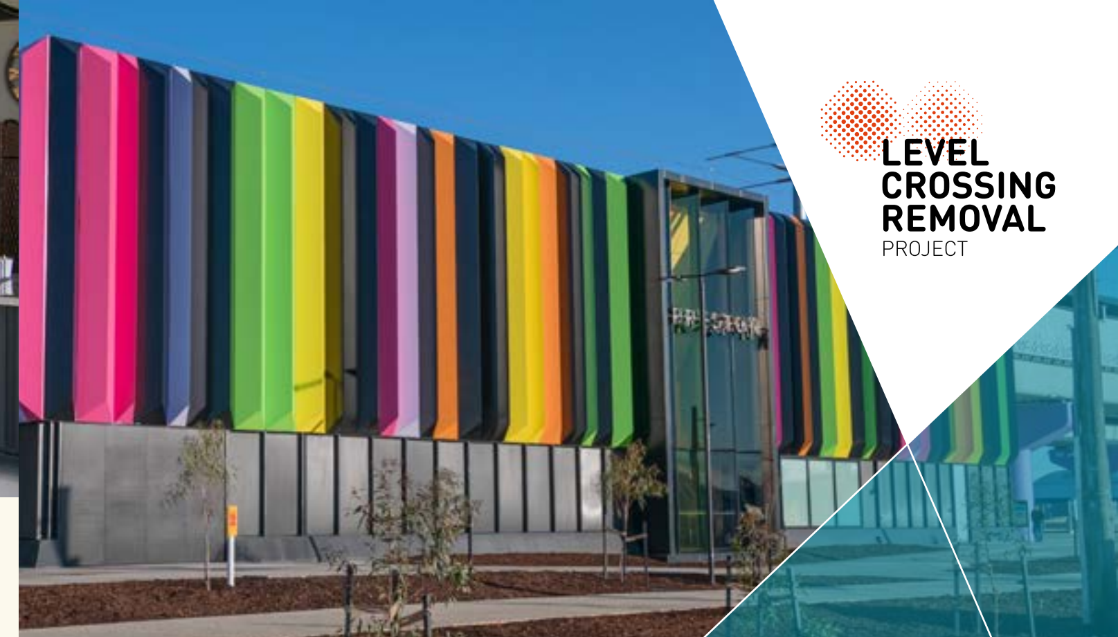
Brand-new Preston Station