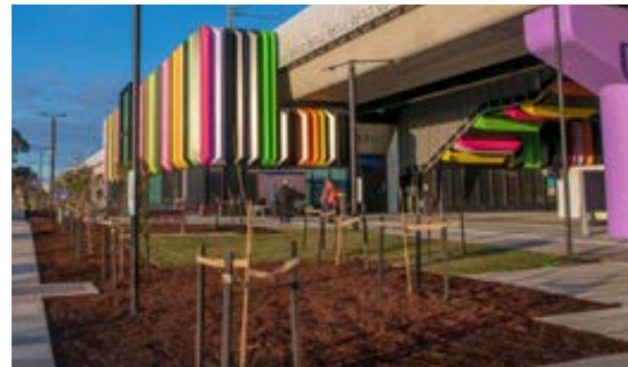
Preston Station landscaping