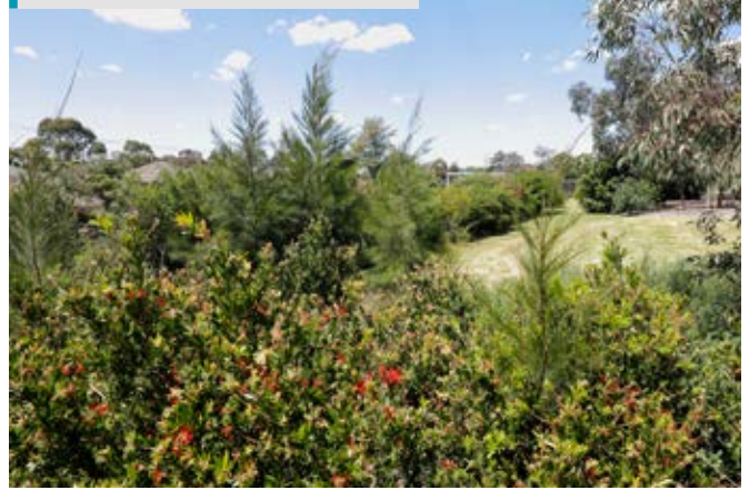
Landscaping at Gardiner Station