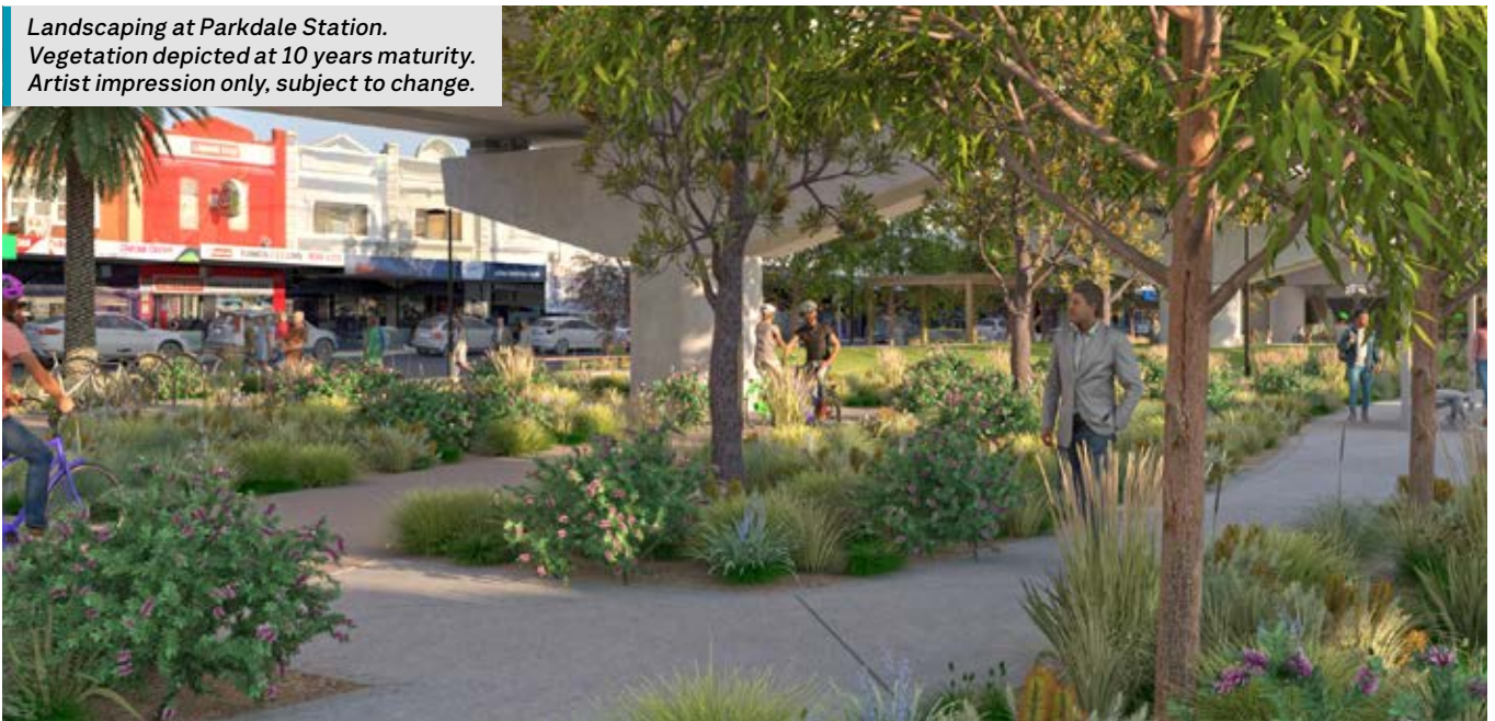
Landscaping at Parkdale Station. Vegetation depicted at 10 years maturity. Artist impression only, subject to change.

We'll plant more than 100,000 trees, shrubs and grasses in the new open space and as part of landscaping along the rail corridor upon project completion.