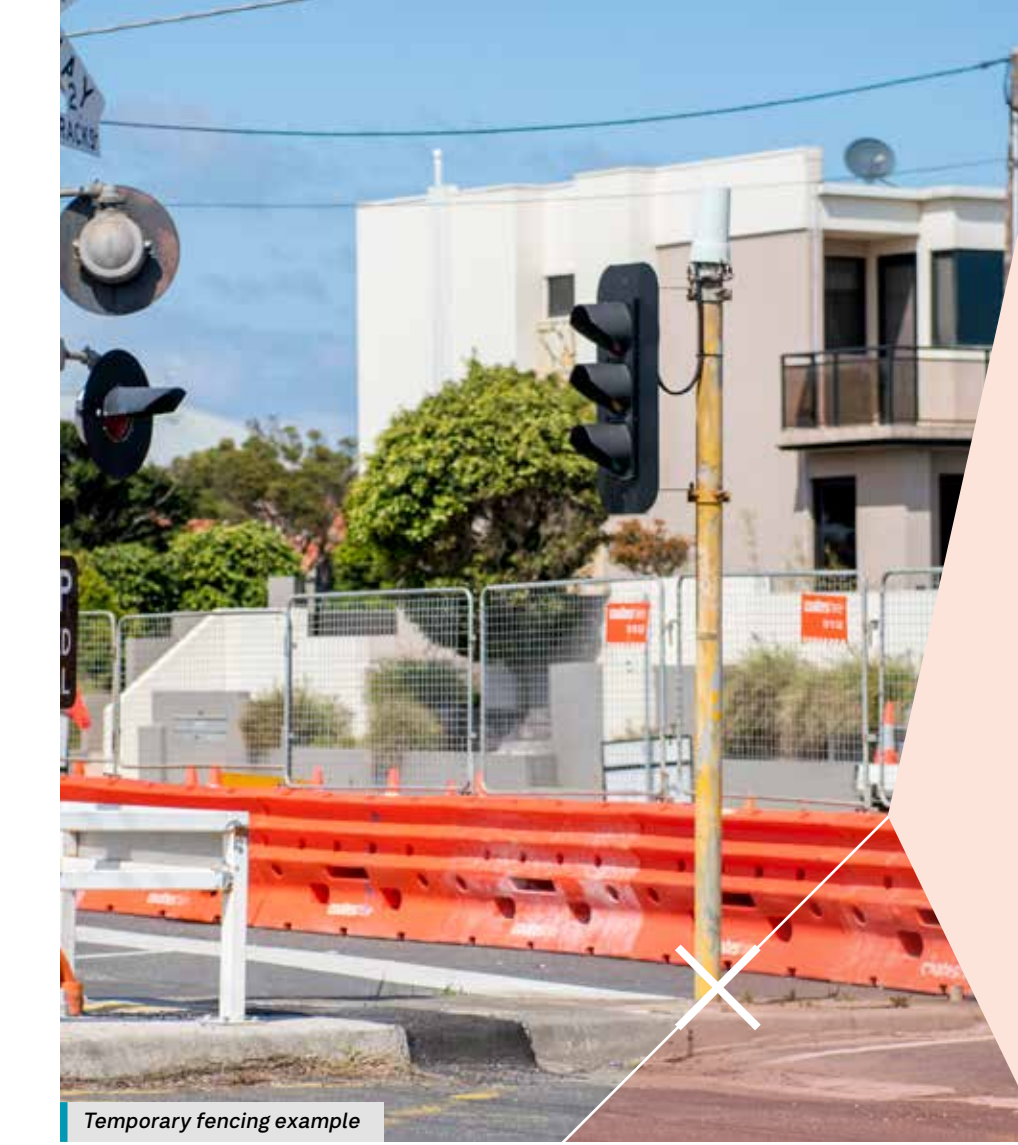
Temporary fencing example