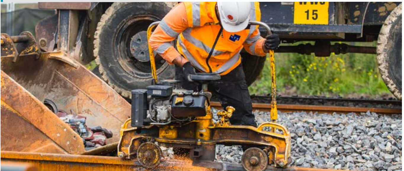
Early works on level crossing removal projects.

For specific information about early works, keep an eye out for our regular works alerts in your letterbox, visit levelcrossings.vic.gov.au/projects/parkers-road-parkdale , call 1800 105 105 or email contact@levelcrossings.vic.gov.au