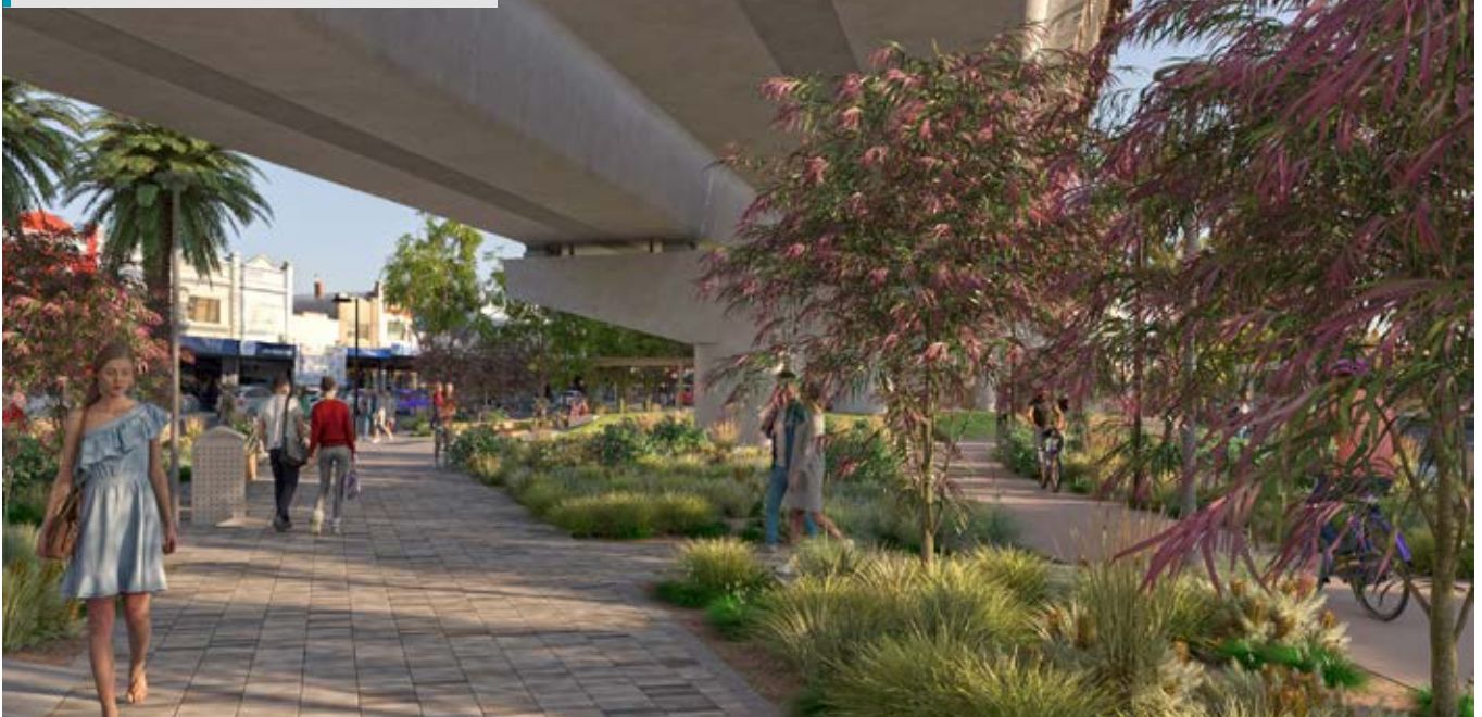
Landscaping at Parkdale Station. Vegetation depicted at 10 years maturity. Artist impression only, subject to change.

To register for text message updates text 'Parkdale' to 0429 839 892.