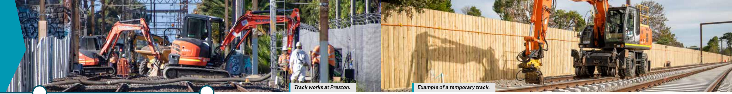
Track works at Preston.

A project of this size and scale involves months of planning to minimise disruption and make the most efficient use of the large machinery and hundreds of workers that we'll bring to the local area.