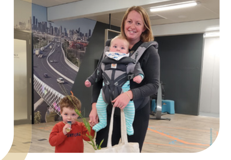
Backyard Planting Program

In total, more than $10,000 in vouchers were given away to eligible residents.