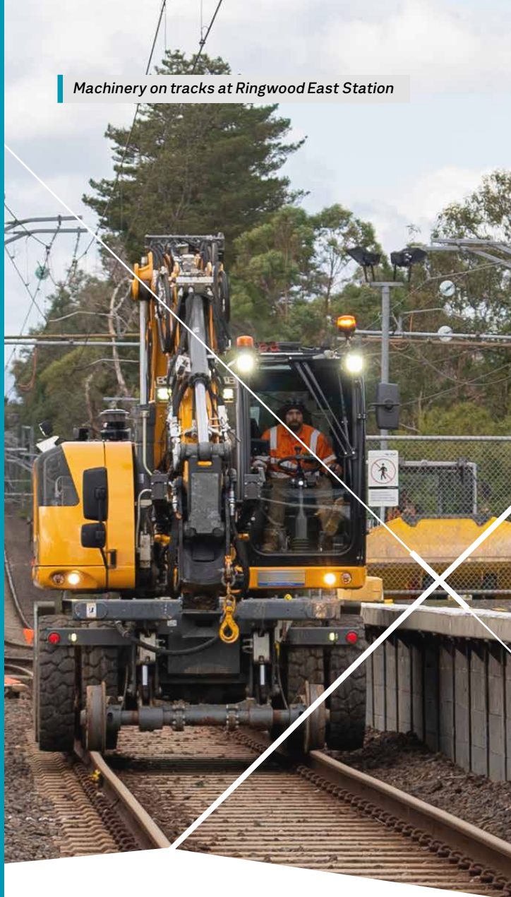
Machinery on tracks at Ringwood East Station

Bedford Road, Ringwood and Dublin Road, Ringwood East - 2023