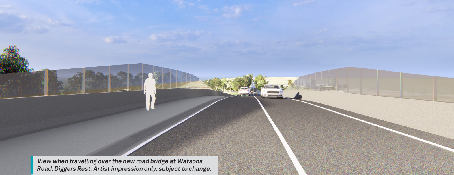
View when travelling over the new road bridge at Watsons Road, Diggers Rest. Artist impression only, subject to change.