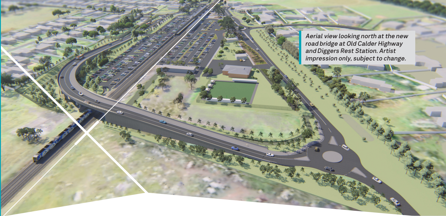
Aerial view looking north at the new road bridge at Old Calder Highway and Diggers Rest Station. Artist impression only, subject to change.

Old Calder Highway and Watsons Road, Diggers Rest / September 2023