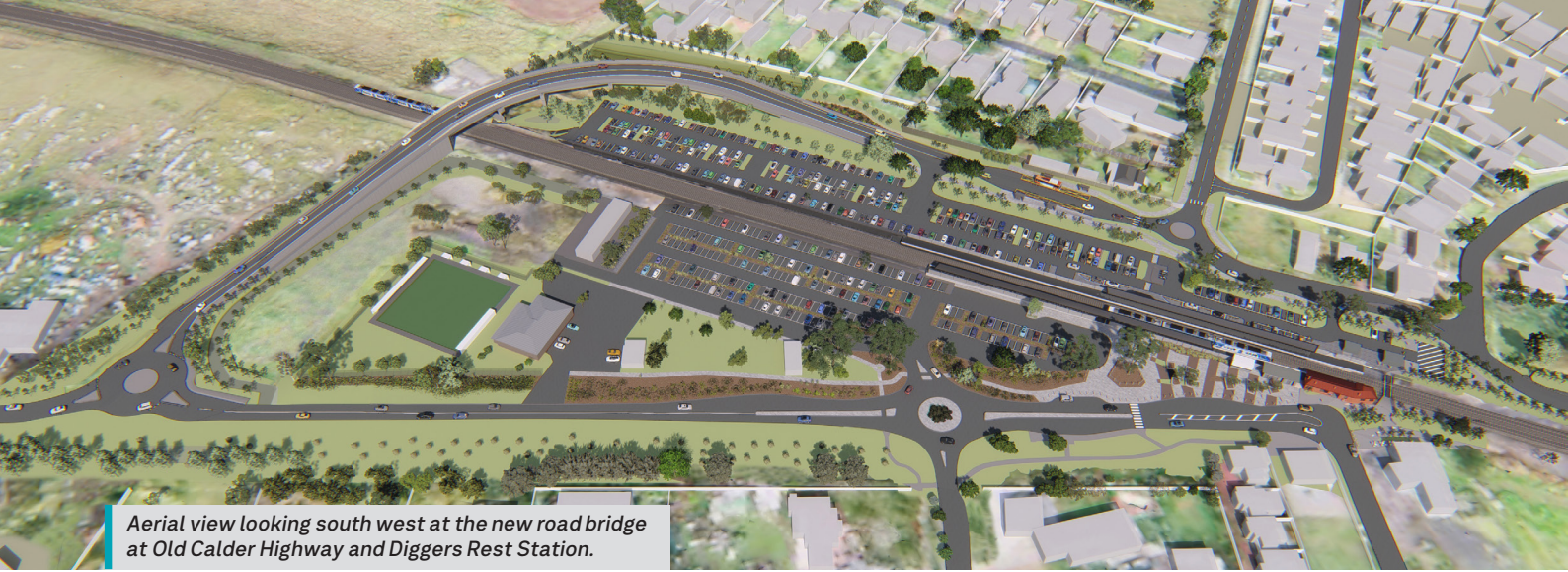
Aerial view looking south west at the new road bridge at Old Calder Highway and Diggers Rest Station.