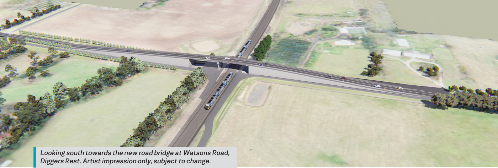
Looking south towards the new road bridge at Watsons Road, Diggers Rest. Artist impression only, subject to change.