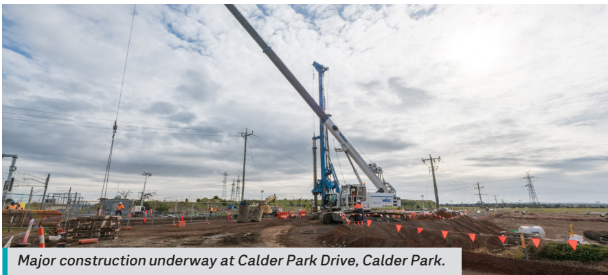
Major construction underway at Calder Park Drive, Calder Park.

Combined with Metro Tunnel, it will give Sunbury Line passengers direct access to five new underground stations, including connections to the City Loop, and will allow trains to travel 100 kilometres from Sunbury to Cranbourne and Pakenham without a single level crossing.