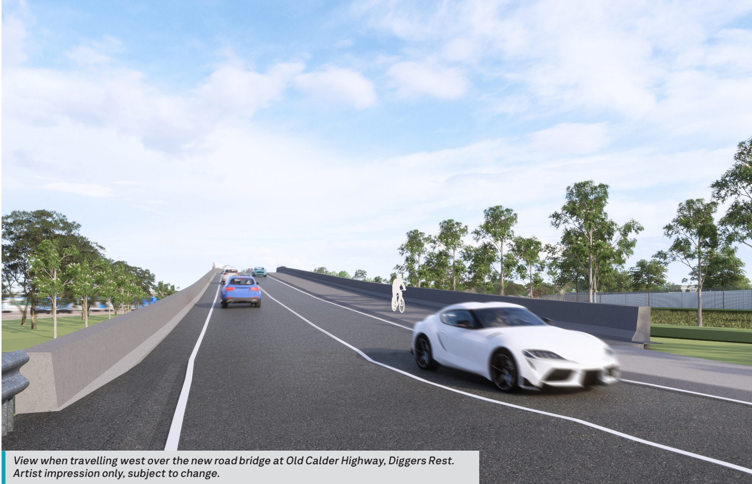
View when travelling west over the new road bridge at Old Calder Highway, Diggers Rest. Artist impression only, subject to change.