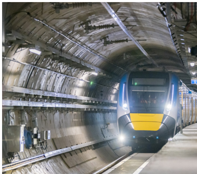
The first test train entering the Metro Tunnel, July 2023

24 hour works are sometimes required during peak construction activities