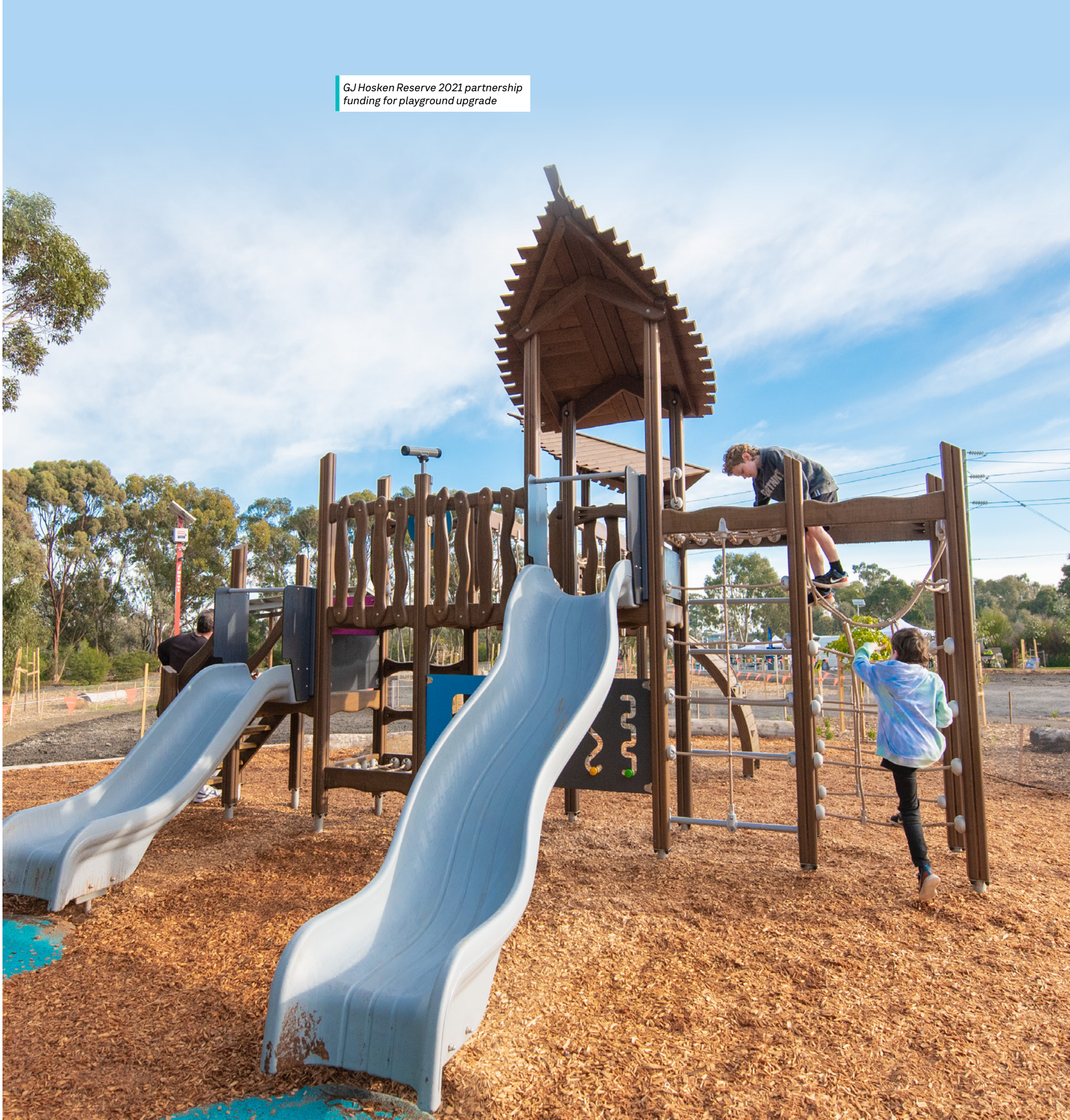
GJ Hosken Reserve 2021 partnership funding for playground upgrade

To discuss any privacy concerns or request access or other changes to the information The West Gate Tunnel Project (MRPV) holds about you, please contact us on 1800 105 105 or email info@wgta.vic.gov.au .