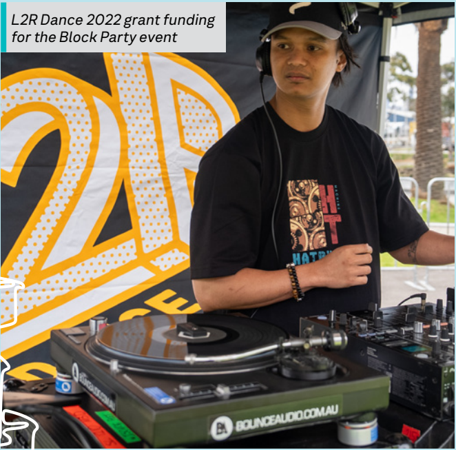
L2R Dance 2022 grant funding for the Block Party event