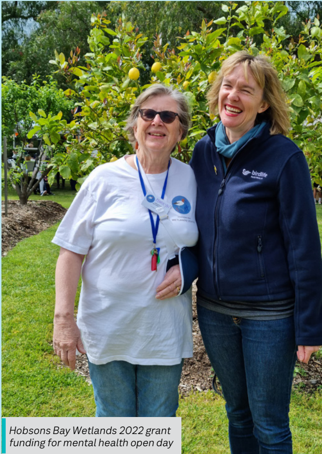
Hobsons Bay Wetlands 2022 grant funding for mental health open day