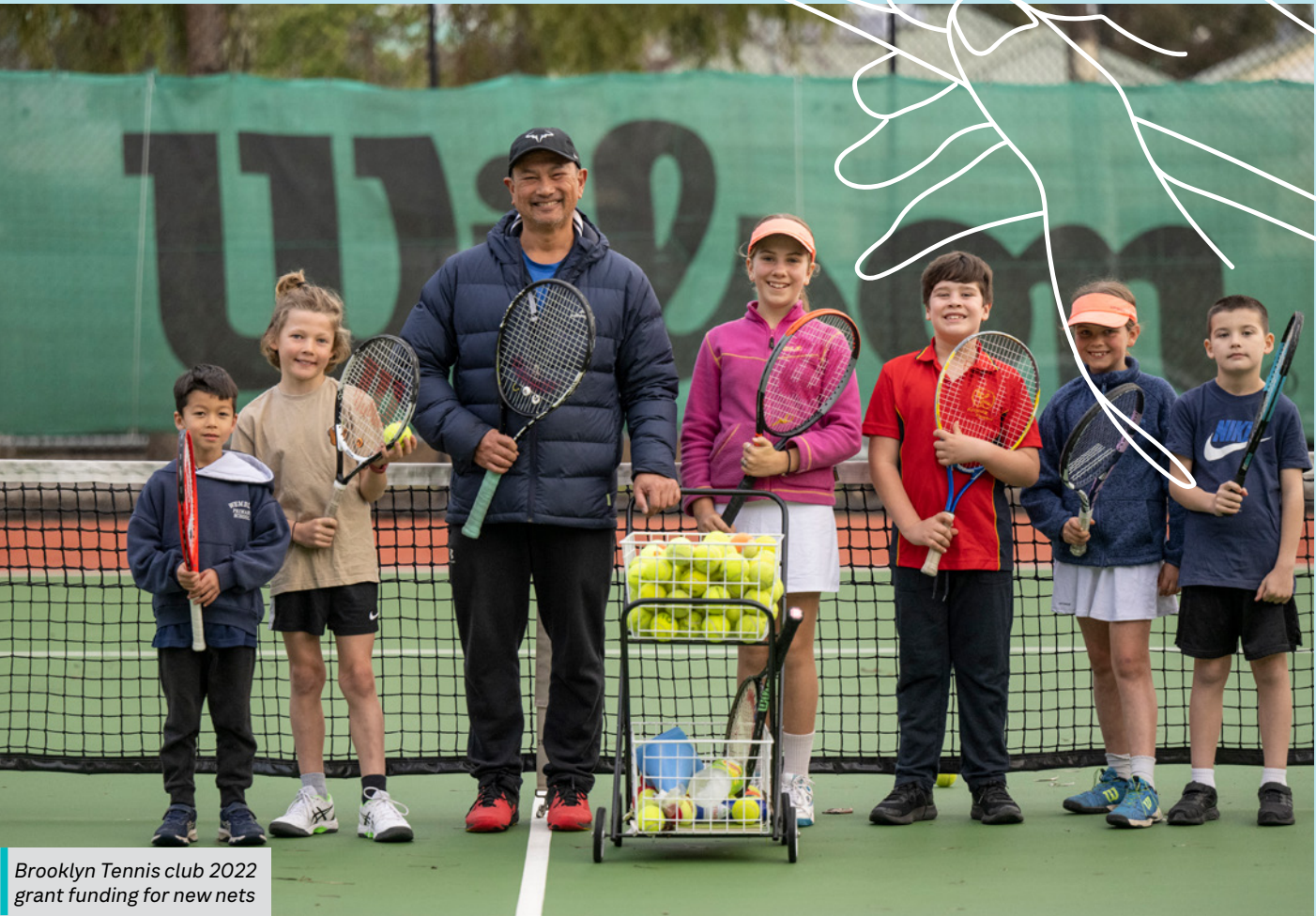
Brooklyn Tennis club 2022 grant funding for new nets