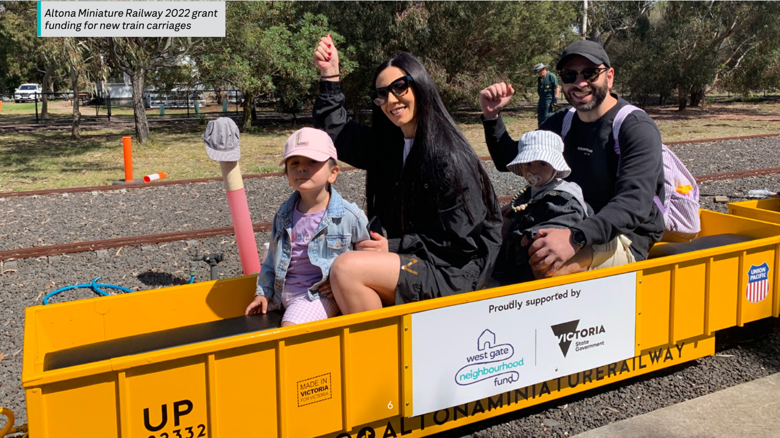
Altona Miniature Railway 2022 grant funding for new train carriages

If you have questions about the West Gate Neighbourhood Fund or require assistance in submitting an application, please contact 1800 105 105 or email info@wgta.vic.gov.au If you require an interpreter, please call 03 9209 0147