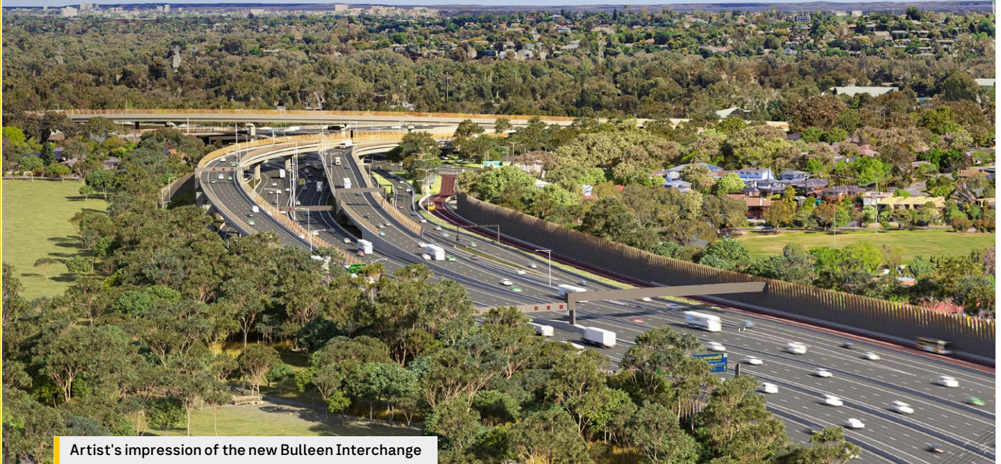
Artist's impression of the new Bulleen Interchange