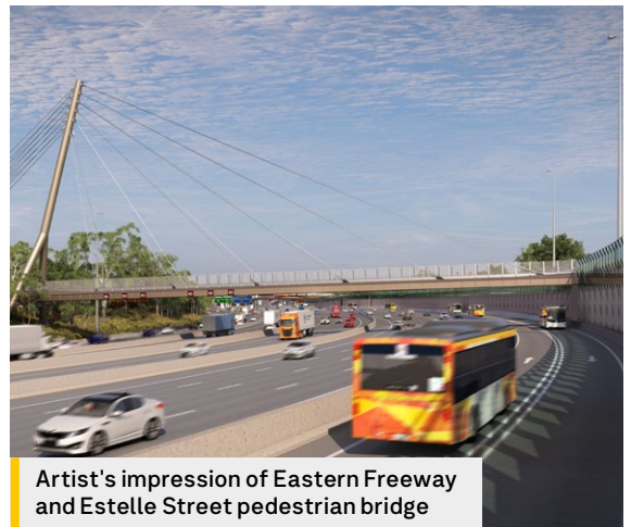
Artist's impression of Eastern Freeway and Estelle Street pedestrian bridge