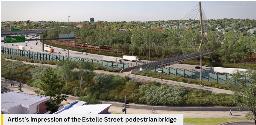
Artist's impression of the Estelle Street pedestrian bridge

We'll do this work at night on the freeway and on major arterials to keep traffic moving freely during the day.