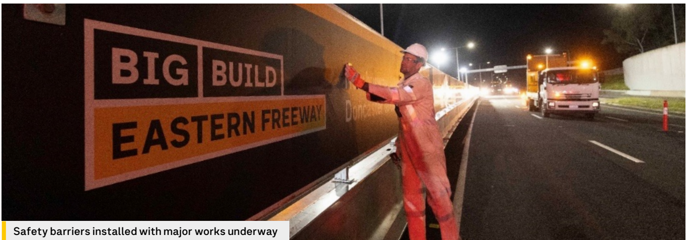
Safety barriers installed with major works underway