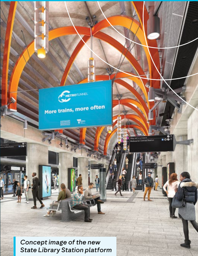
Concept image of the new State Library Station platform