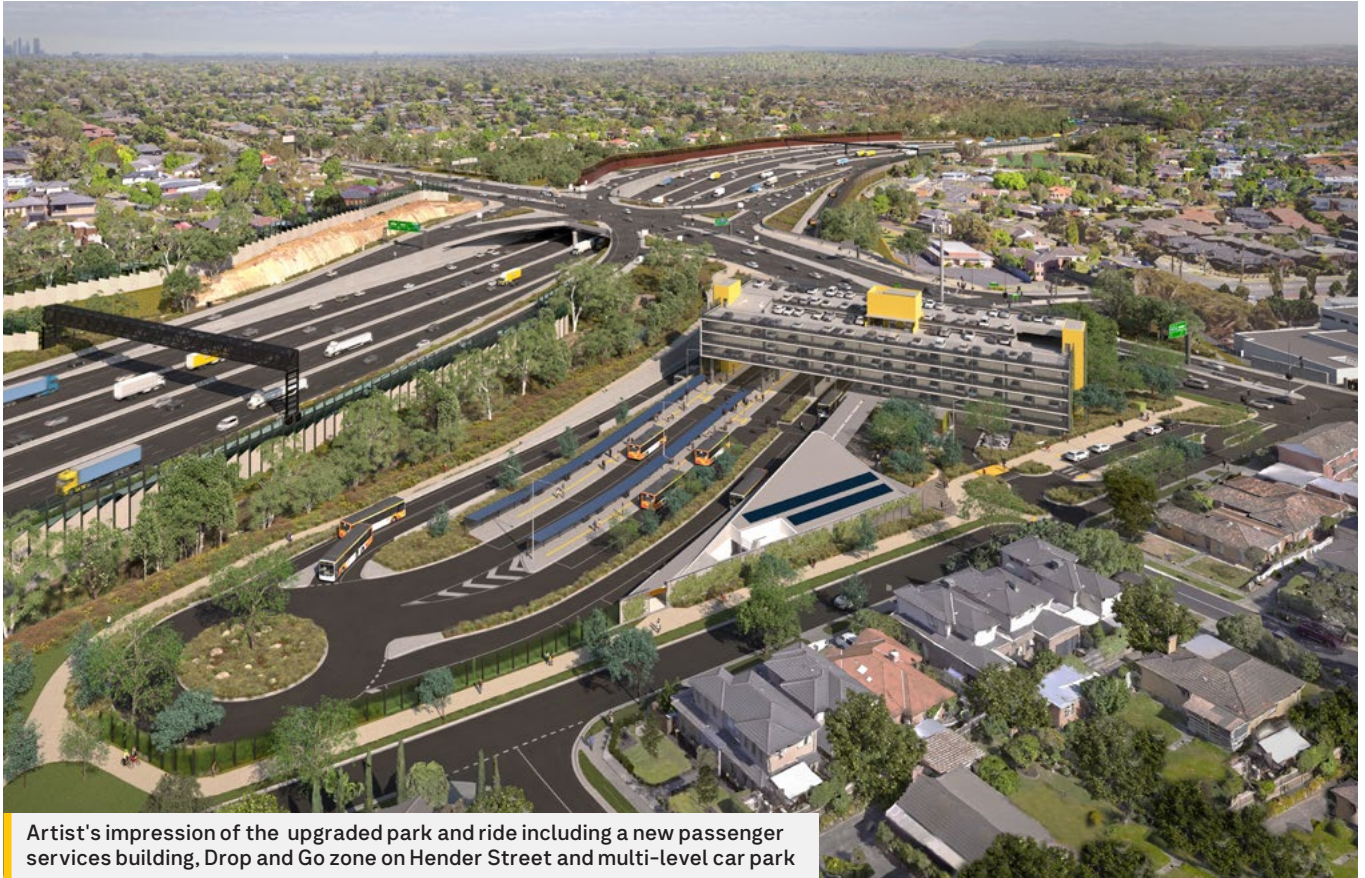
Artist's impression of the upgraded park and ride including a new passenger services building, Drop and Go zone on Hender Street and multi-level car park

We're upgrading Doncaster Park and Ride and connecting it to Melbourne's first dedicated busway to reduce travel times and improve public transport in Melbourne's east.