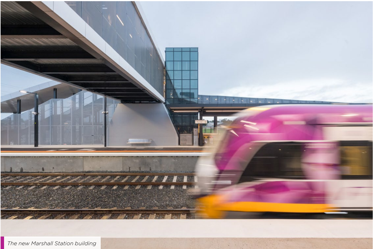
The new Marshall Station building