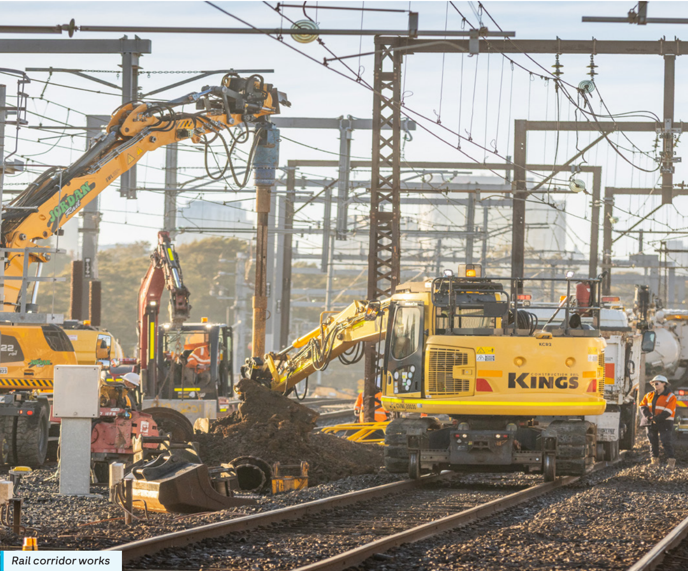
Rail corridor works