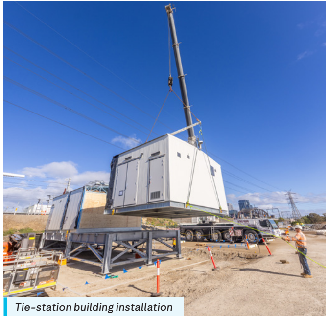
Tie-station building installation

24 hour works are sometimes required during peak construction activities We will notify if out of hours works are required