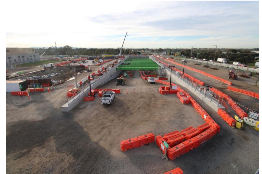
Eastern tunnel entrance