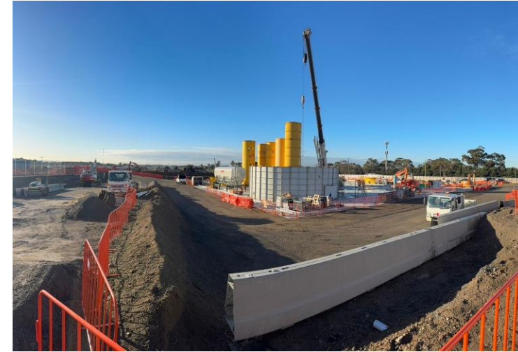
Bentonite plant installation