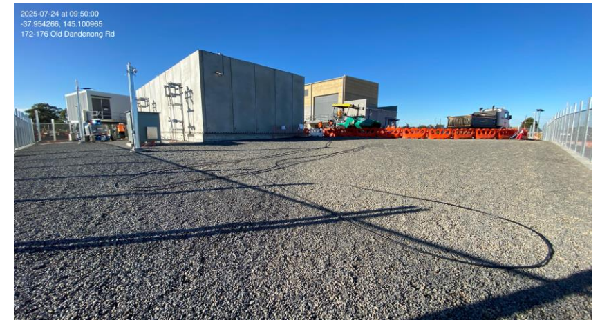
Network support facility