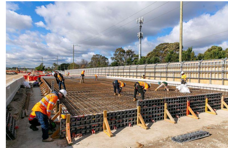
Foundation for water treatment plant