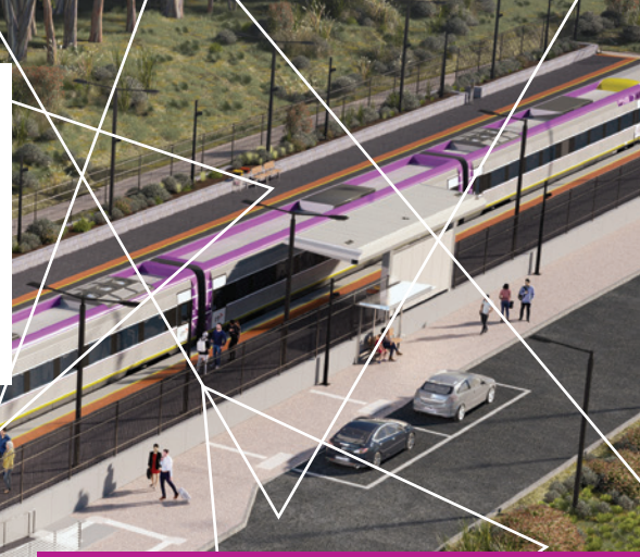
Bunyip Station concept image.