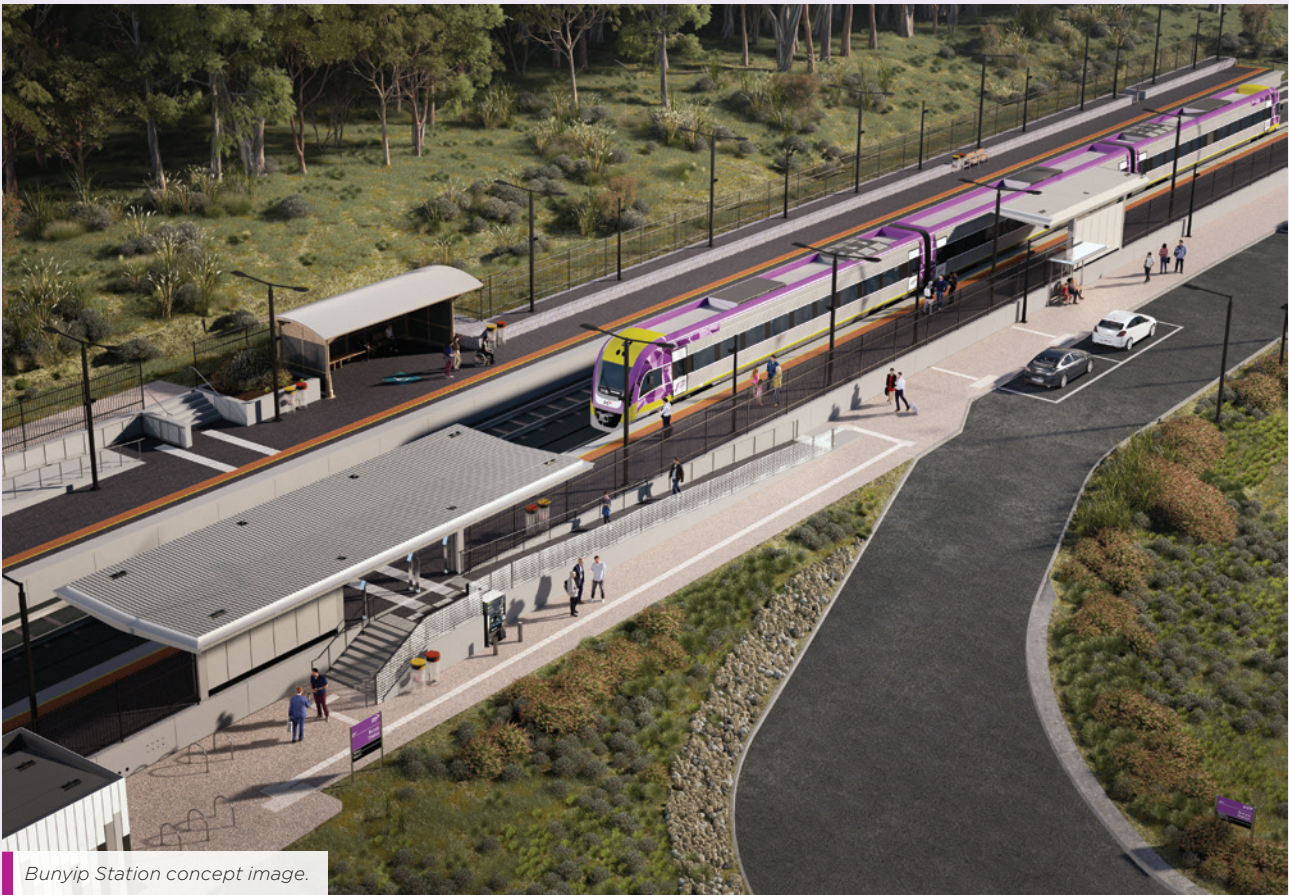
Bunyip Station concept image.