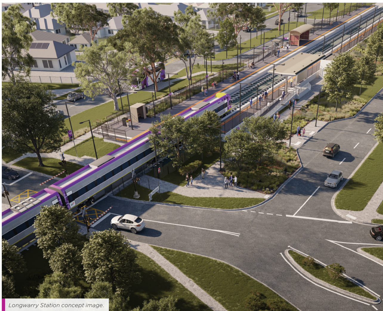
Longwarry Station concept image.

The new accessible second platform will also help provide more opportunities for trains to pass each other and deliver more frequent and reliable train services. The existing platform will also be upgraded to be more accessible and with amenity improvements such as seating and shelter.