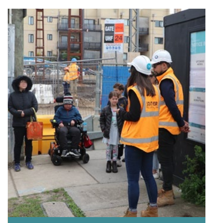
Glen Huntly locals getting a look behind the scenes