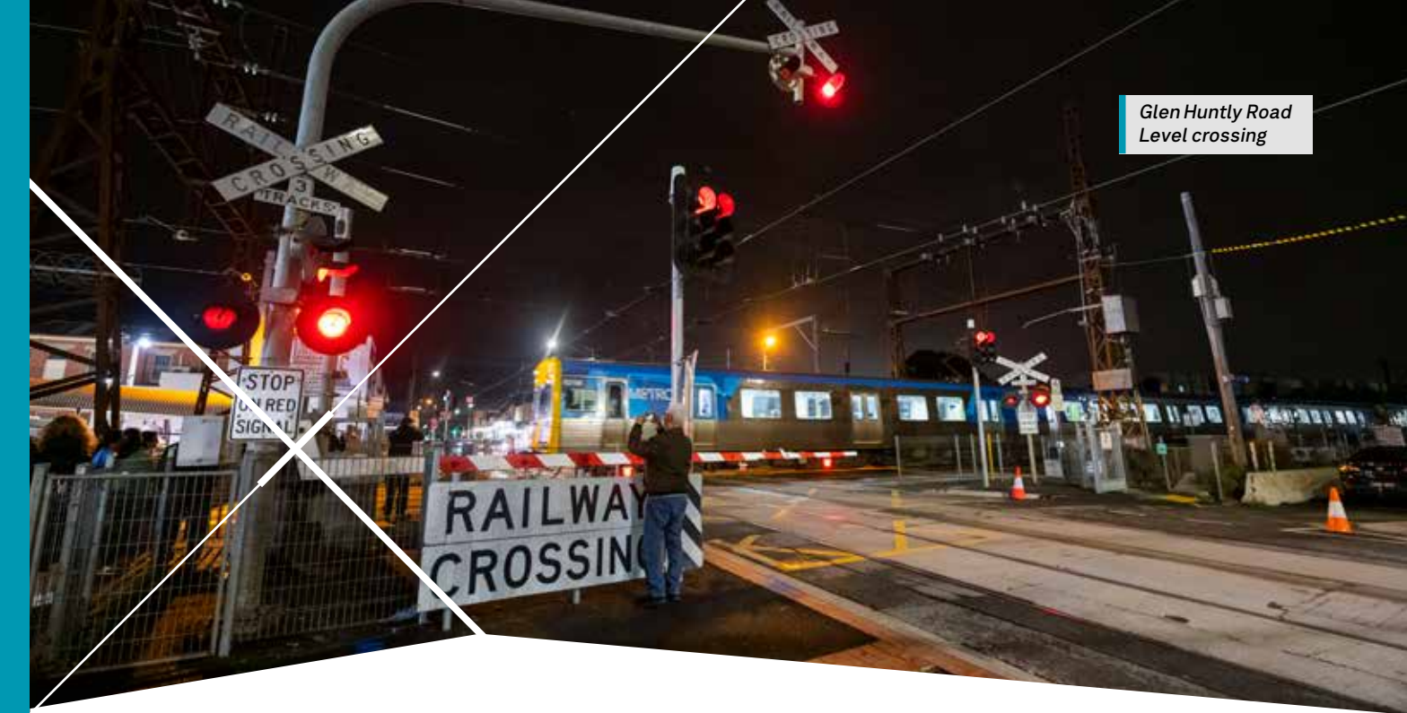
Glen Huntly Road Level crossing

Neerim Road and Glen Huntly Road, Glen Huntly, Issue #9 – April 2023