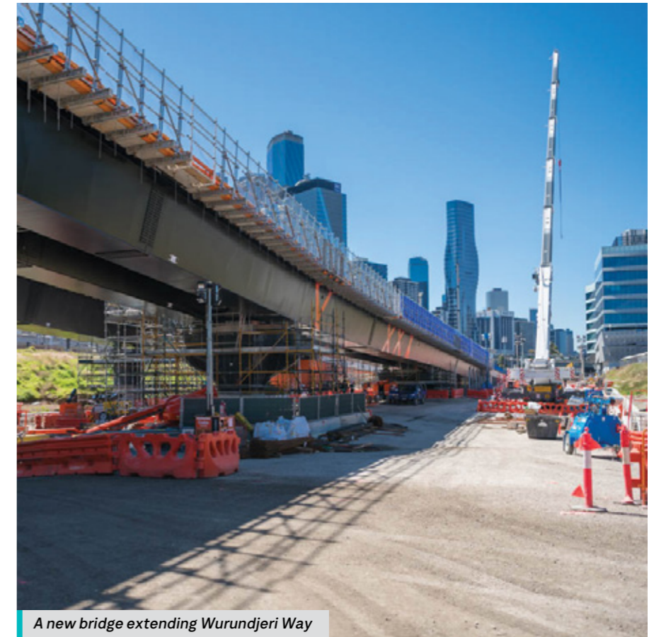
A new bridge extending Wurundjeri Way

There will further work to continue building the city bypass this summer.