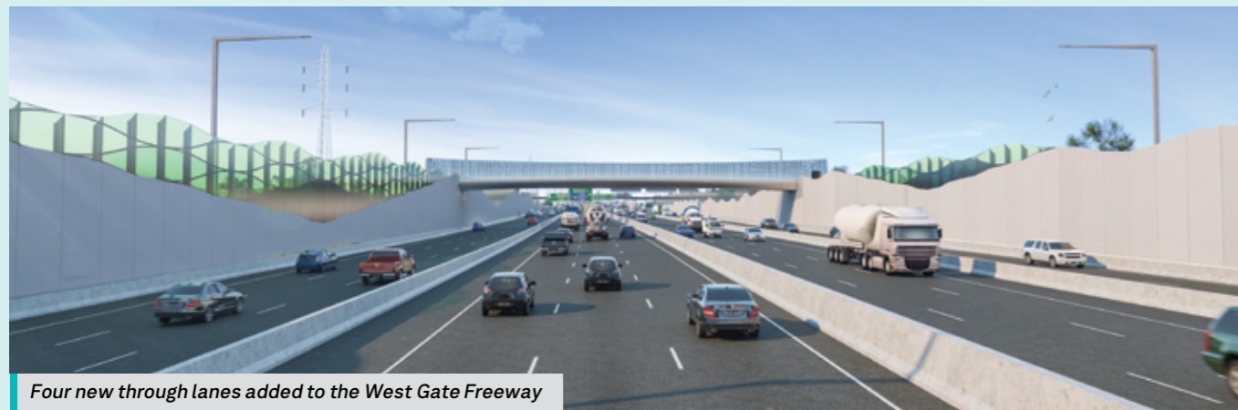
Four new through lanes added to the West Gate Freeway

Thank you for your patience during this time.