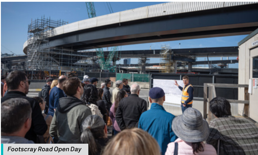
Footscray Road Open Day

Keep an eye out on our website for future events.