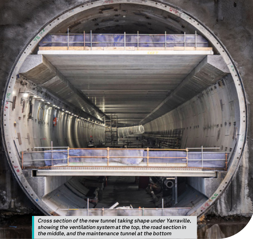
Cross section of the new tunnel taking shape under Yarraville, showing the ventilation system at the top, the road section in the middle, and the maintenance tunnel at the bottom