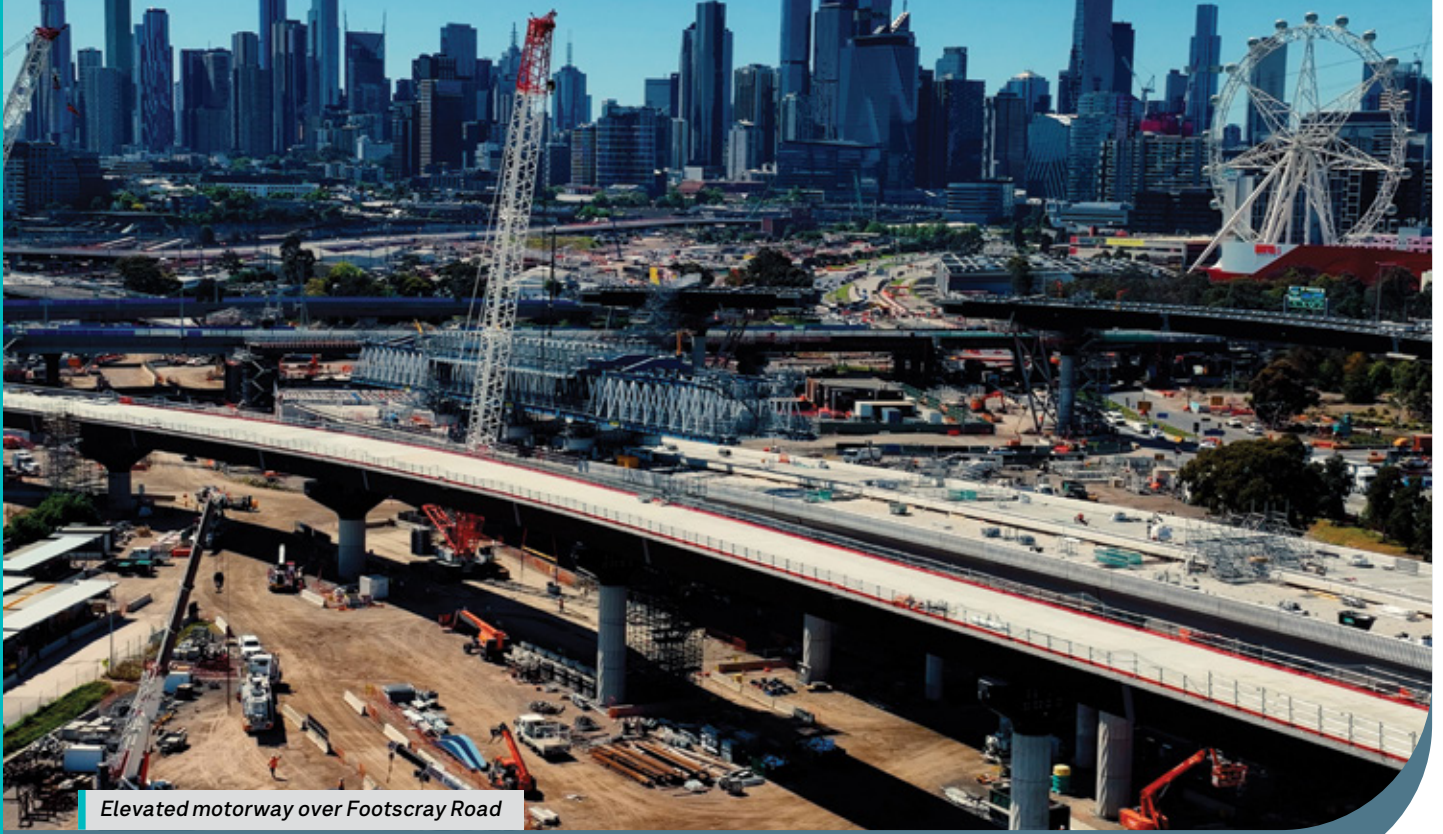
Elevated motorway over Footscray Road