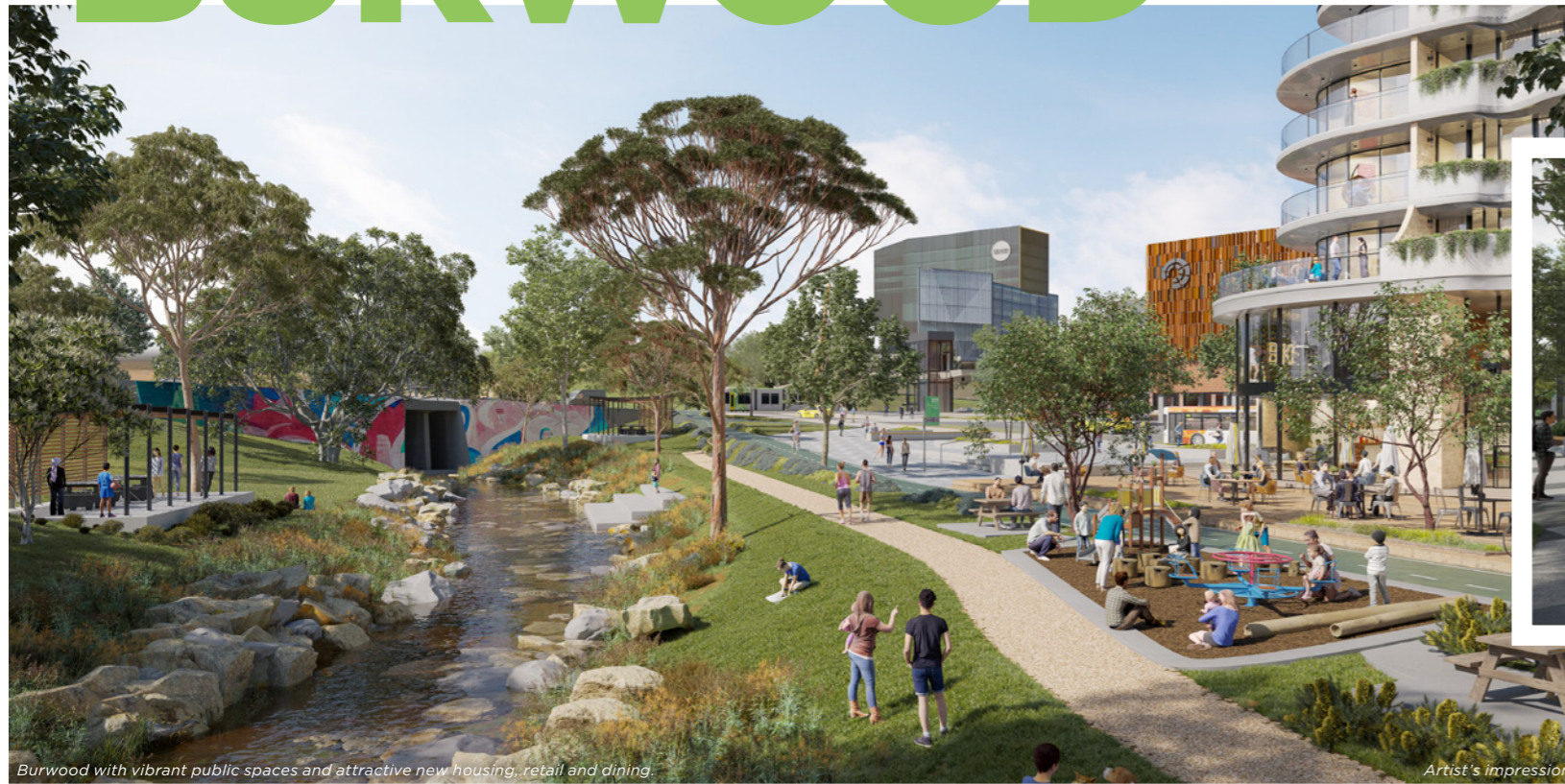
Burwood with vibrant public spaces and attractive new housing, retail and dining.