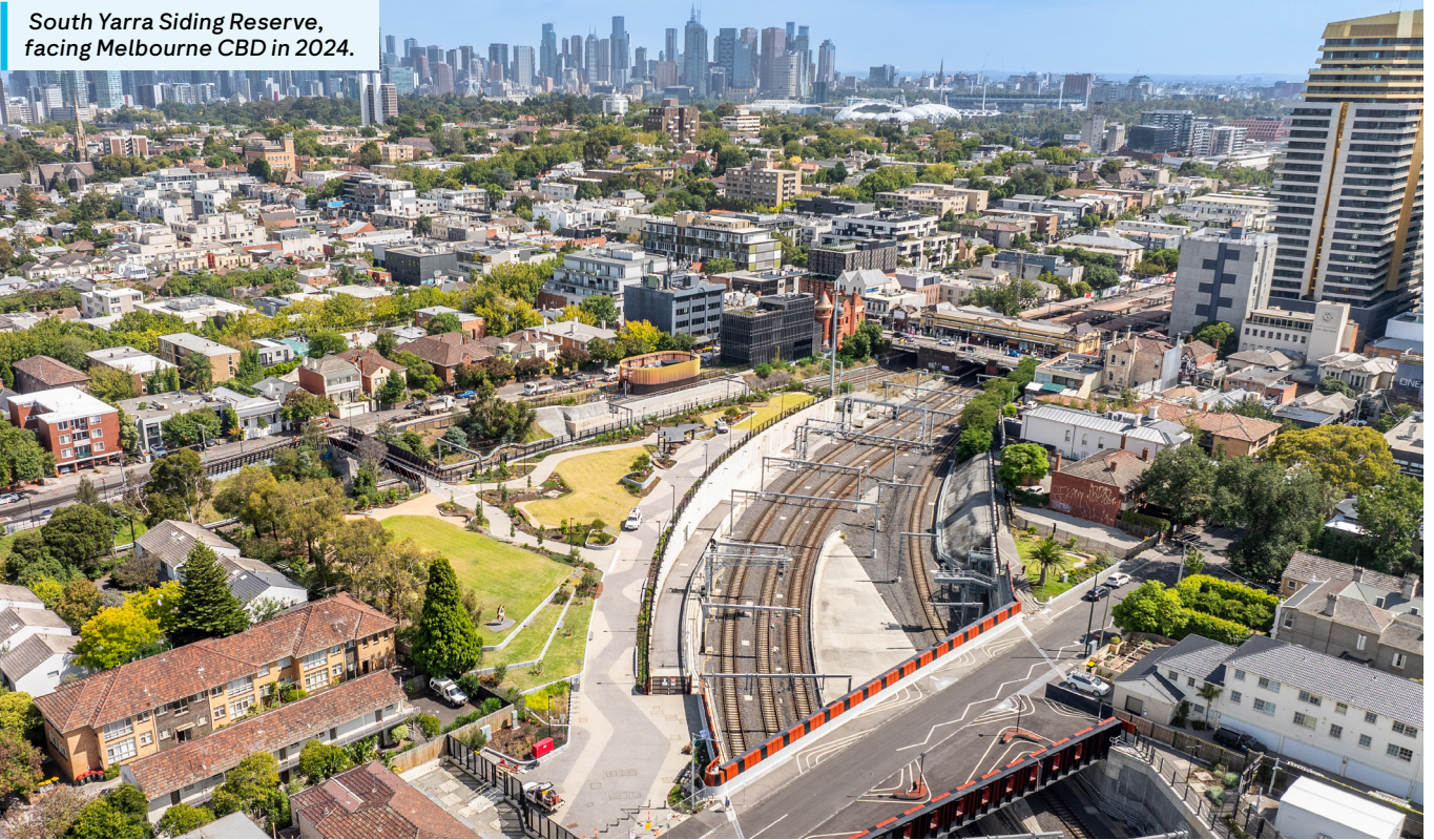
South Yarra Siding Reserve, facing Melbourne CBD in 2024.