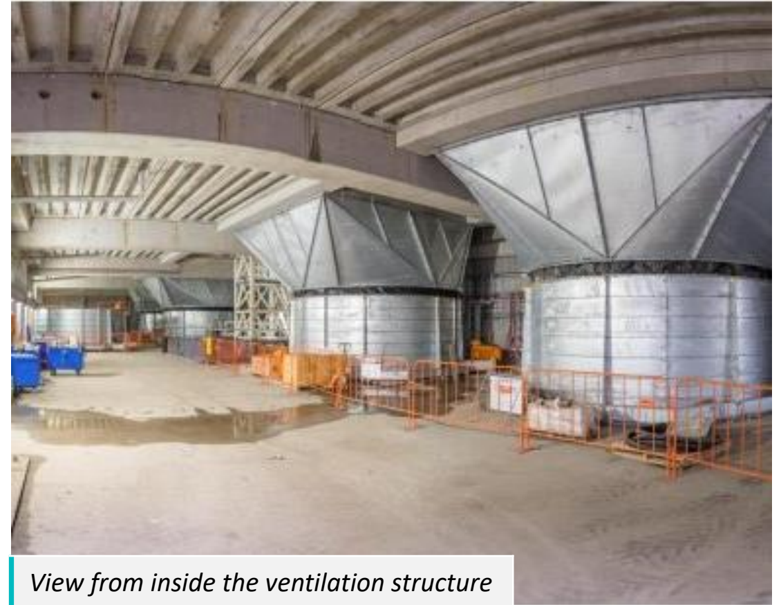
View from inside the ventilation structure