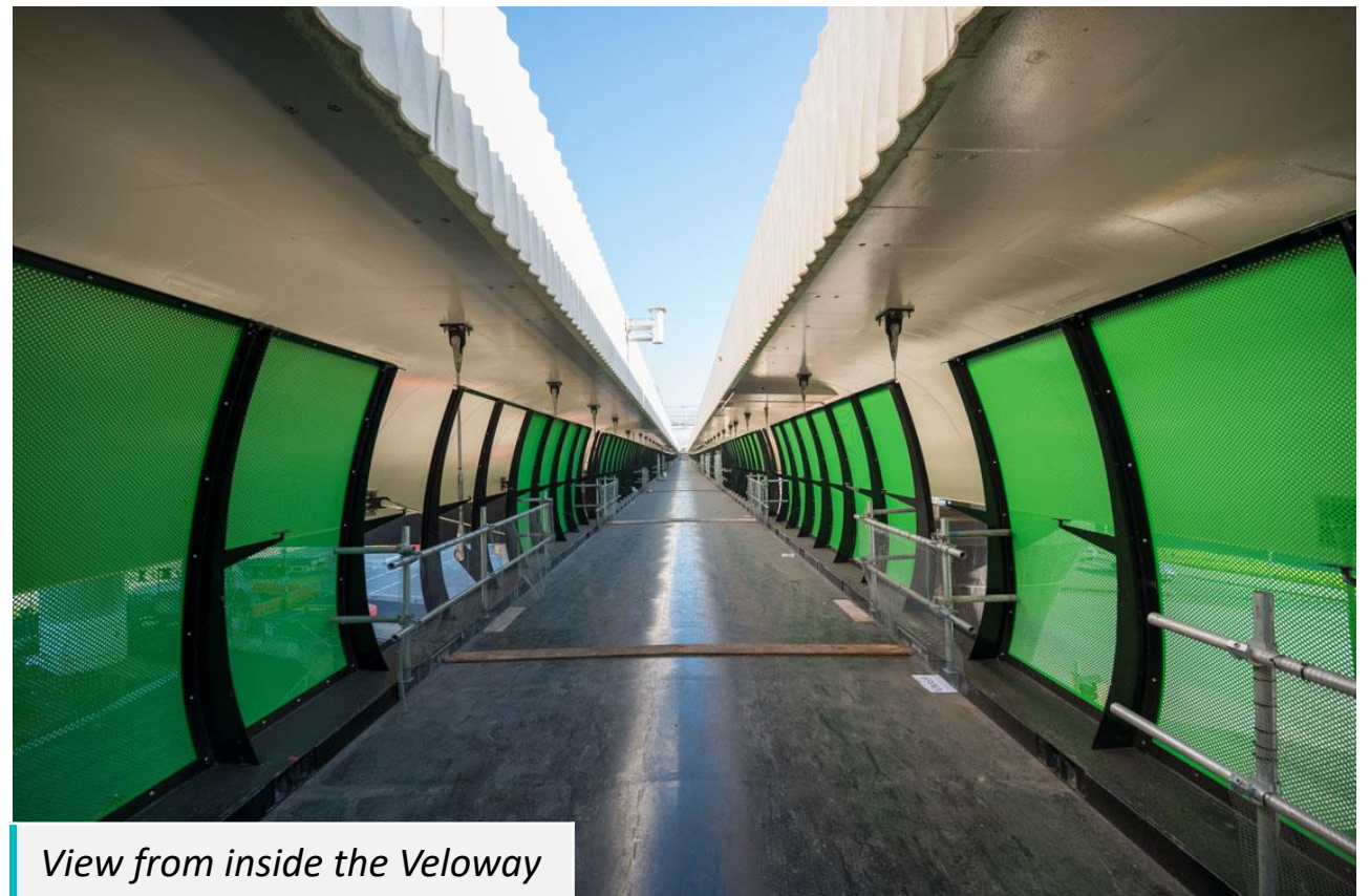
View from inside the Veloway