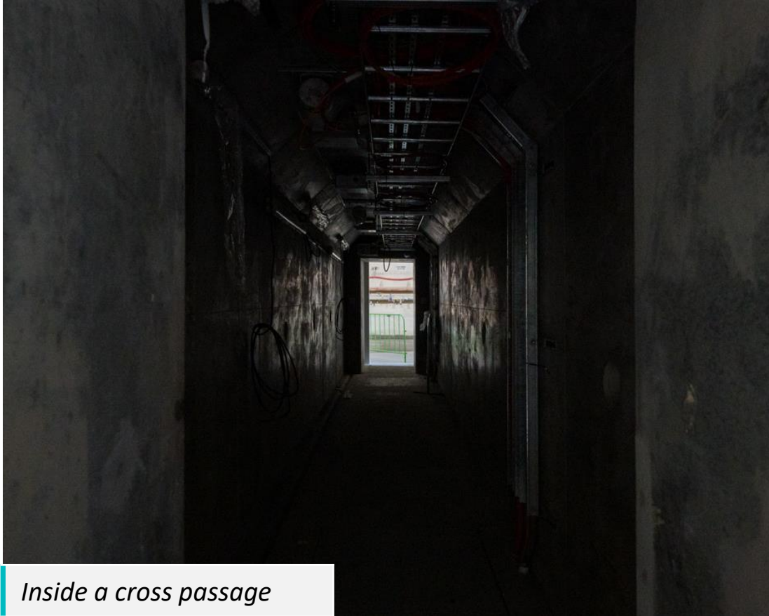
Inside a cross passage