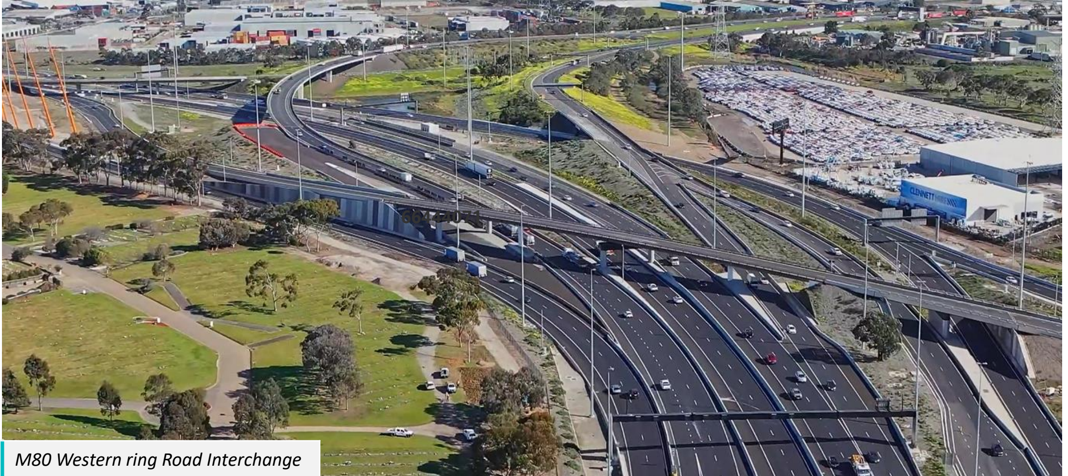
M80 Western ring Road Interchange