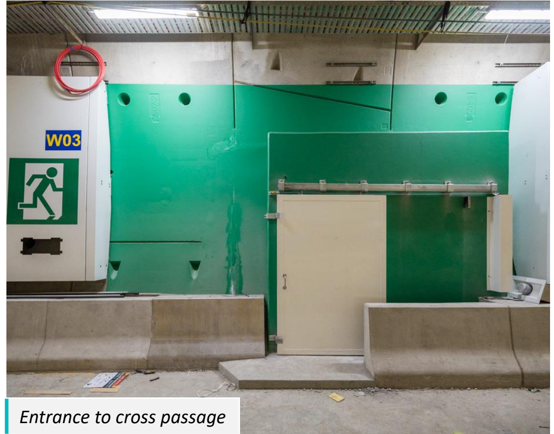
Entrance to cross passage