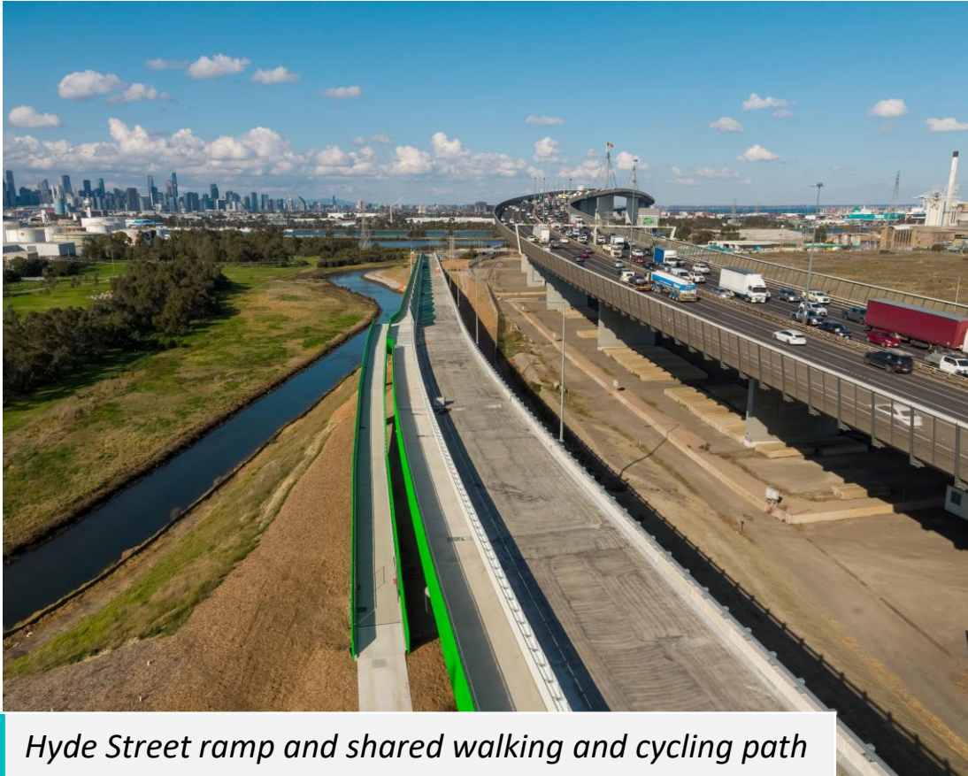
Hyde Street ramp and shared walking and cycling path