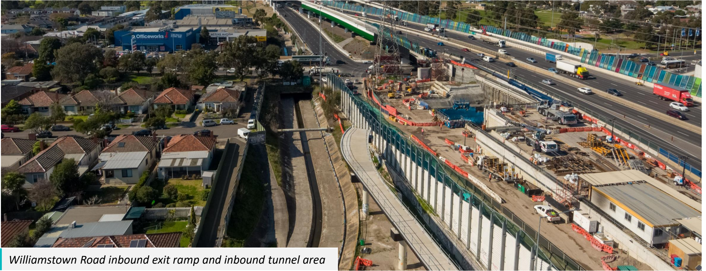
Williamstown Road inbound exit ramp and inbound tunnel area