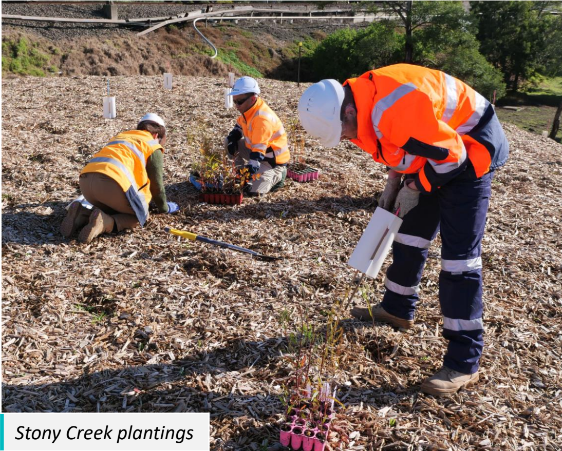
Stony Creek plantings