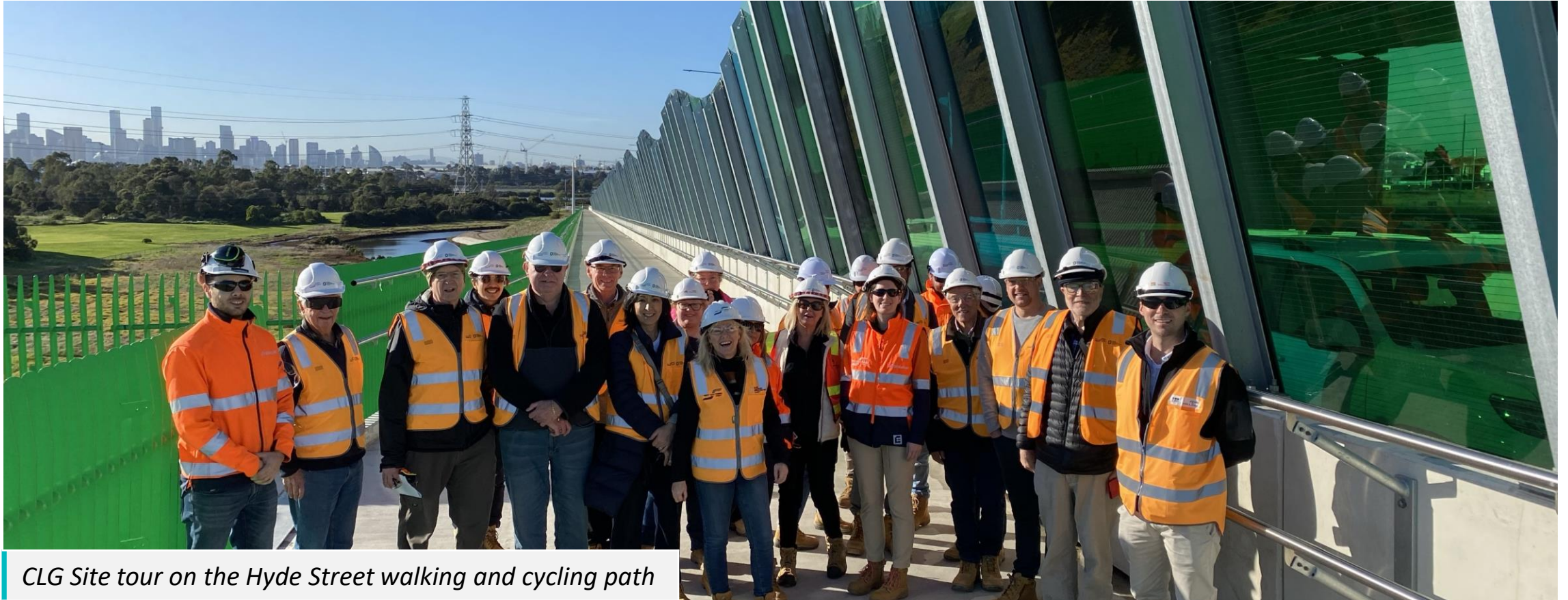
CLG Site tour on the Hyde Street walking and cycling path