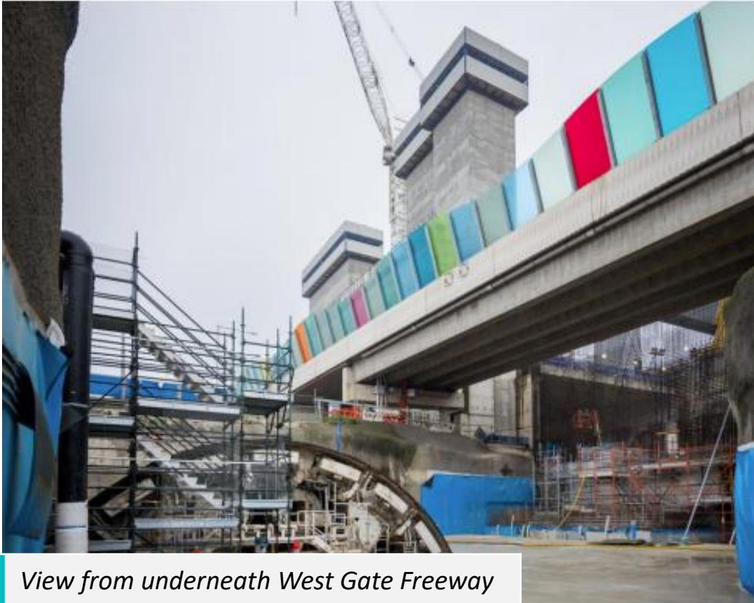
View from underneath West Gate Freeway