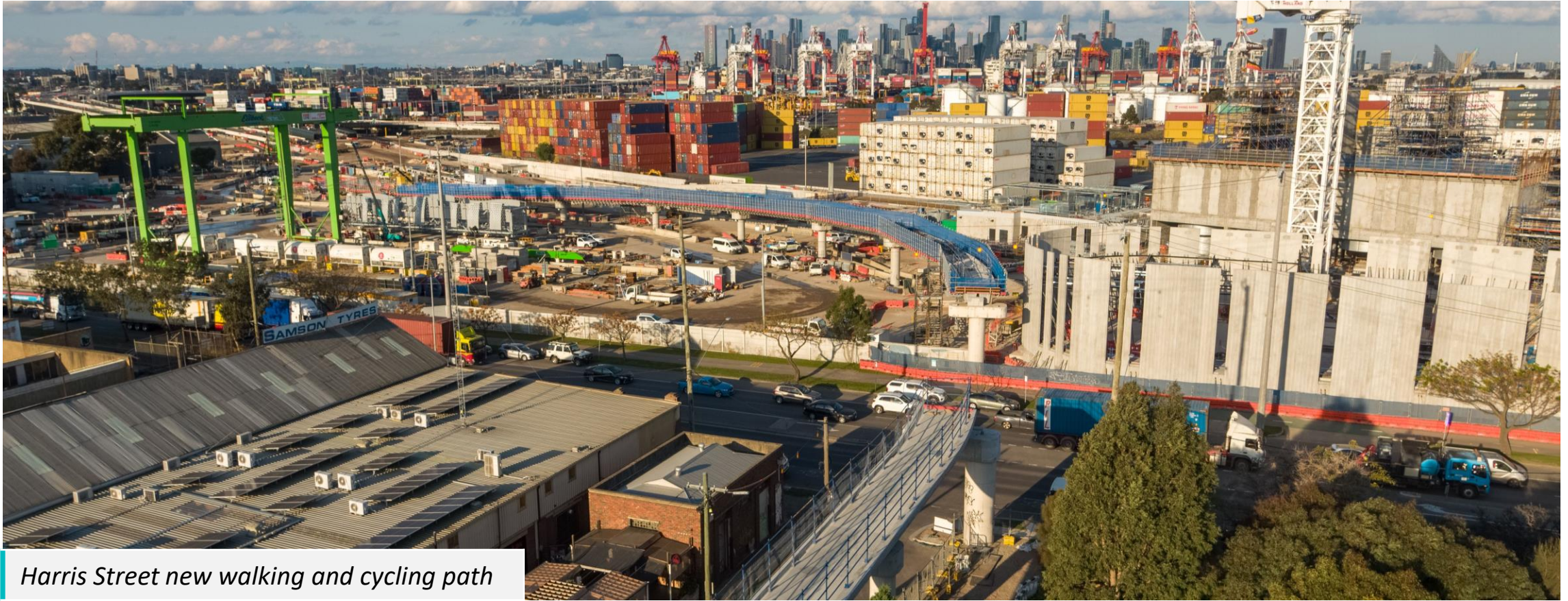
Harris Street new walking and cycling path