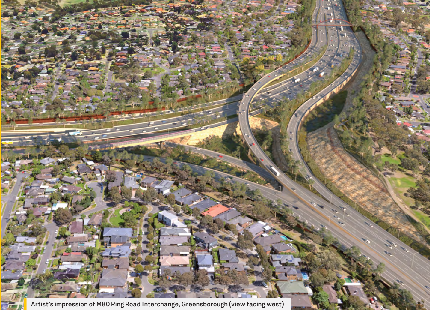
Artist's impression of M80 Ring Road Interchange, Greensborough (view facing west)