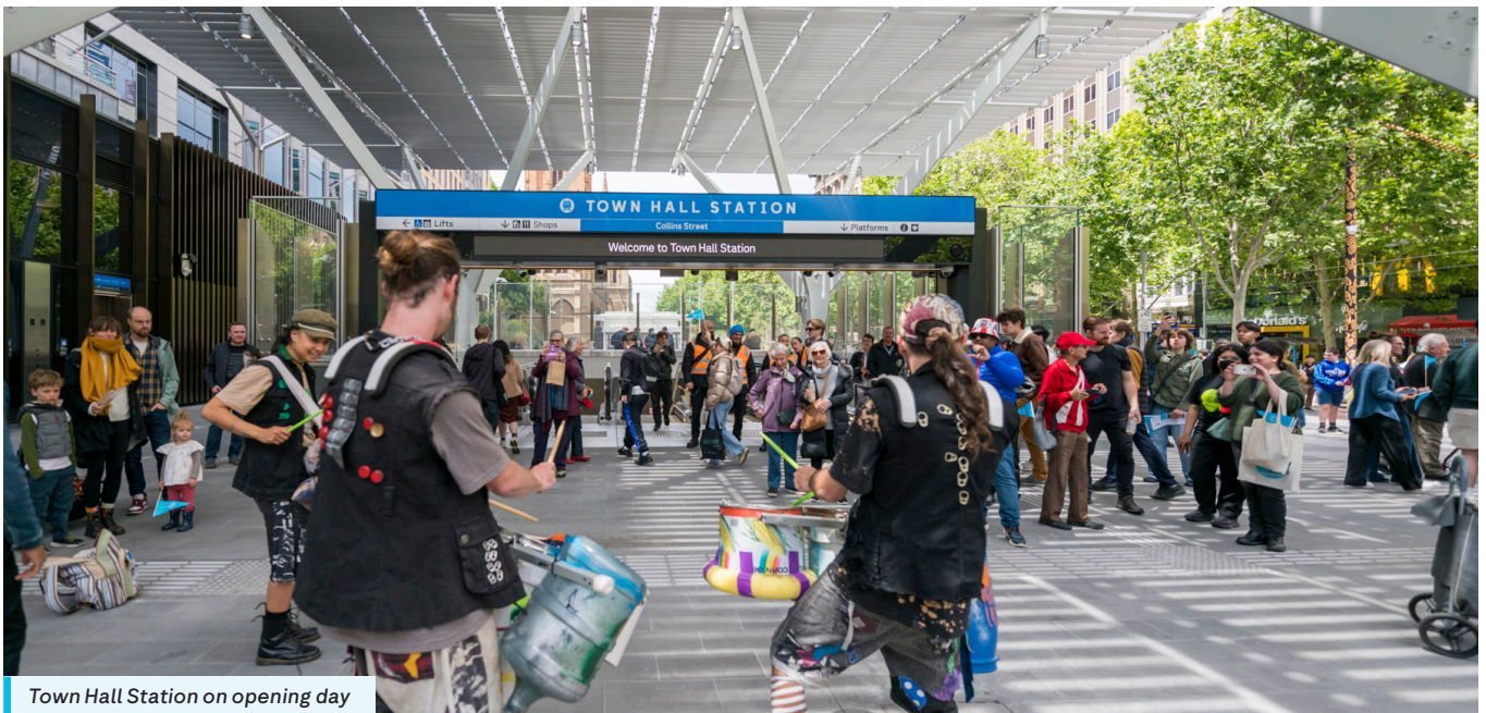
Town Hall Station on opening day

From the Metro Tunnel's opening on 30 November, public transport in Victoria will be free for everyone every weekend until 1 February 2026.