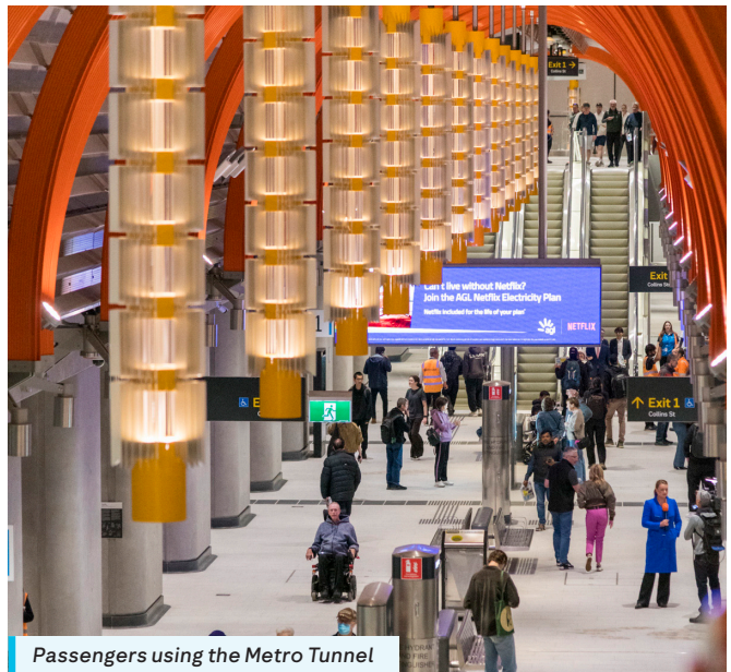
Passengers using the Metro Tunnel

24 hour works are sometimes required during peak construction activities