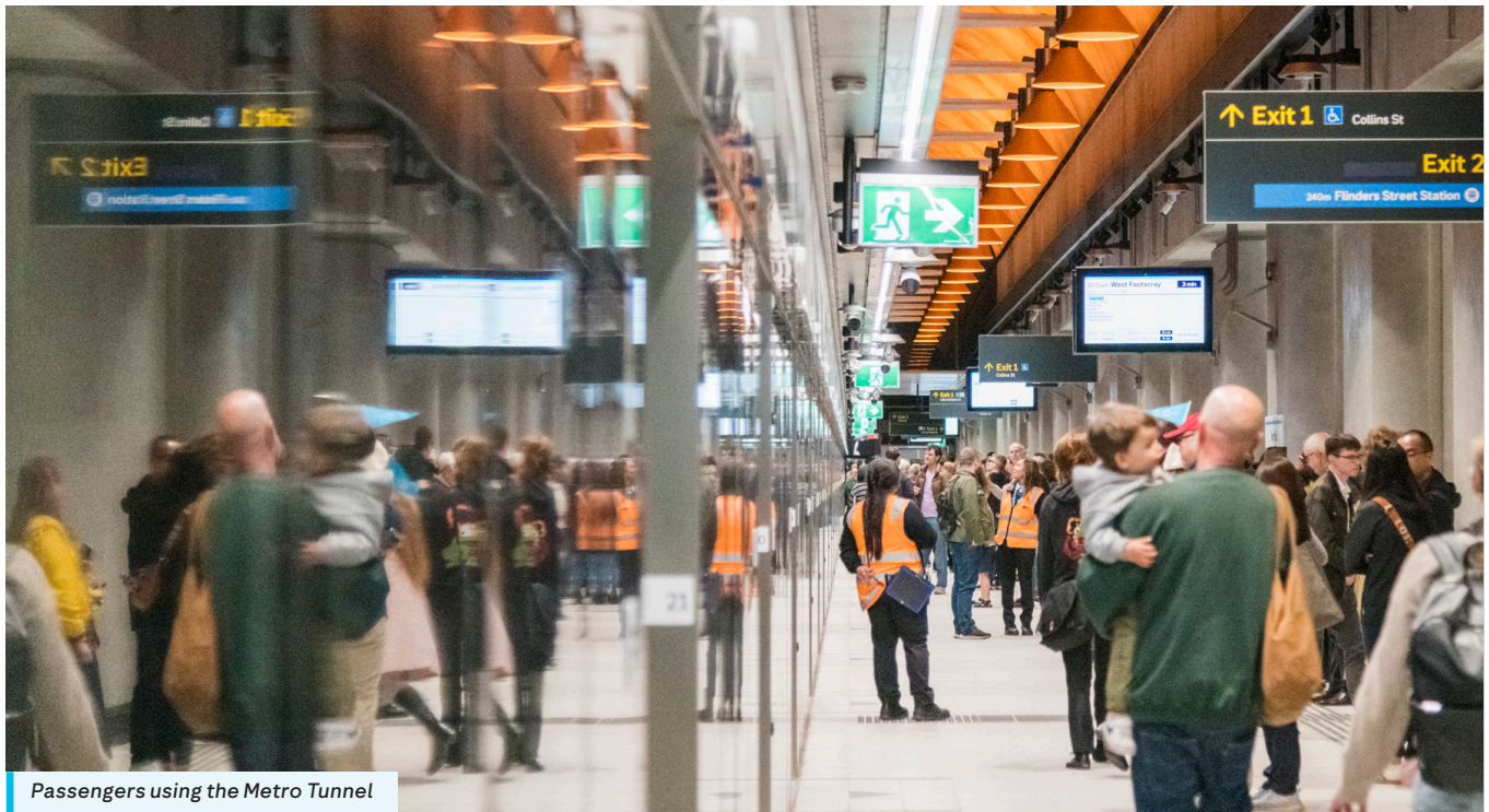
Passengers using the Metro Tunnel