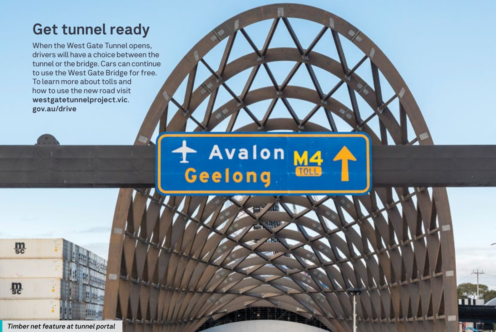
Timber net feature at tunnel portal

When the West Gate Tunnel opens, drivers will have a choice between the tunnel or the bridge. Cars can continue to use the West Gate Bridge for free. To learn more about tolls and how to use the new road visit westgatetunnelproject.vic.gov.au/drive