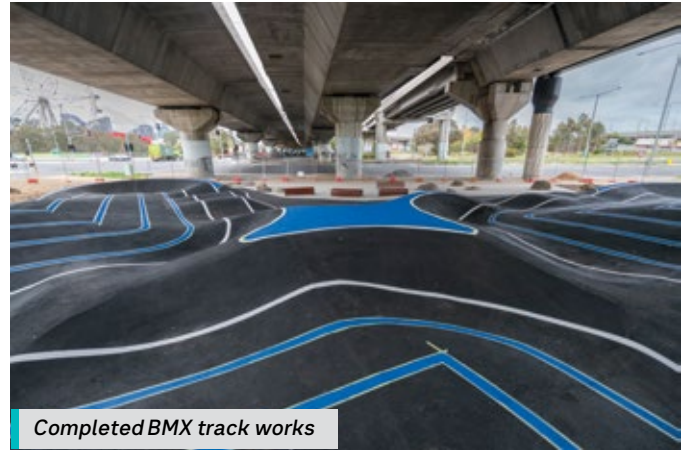
Completed BMX track works

This pocket of former industrial land has been transformed into a vibrant and open green space, providing a naturalised environment that links directly to Yarraville Gardens via a new walking and cycling path over Whitehall Street and down to the Maribyrnong River.