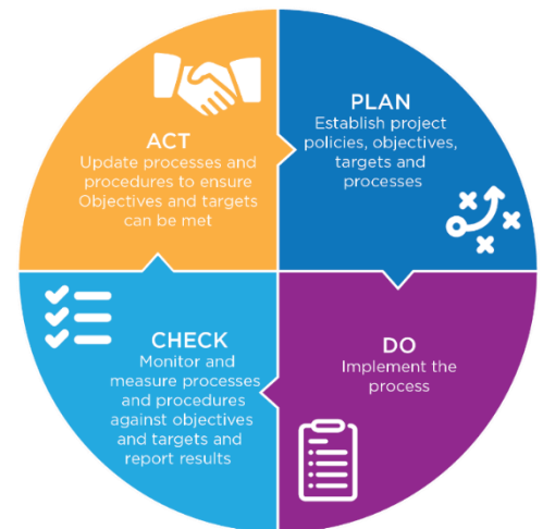
Figure 6: Spark Environmental Management System framework

Spark's EMS for the Primary Package comprises a hierarchy of the Spark Environmental Strategy, CEMP, WEMPs and environmental procedures to effectively mitigate risk and monitor environmental performance and compliance at every level of construction.