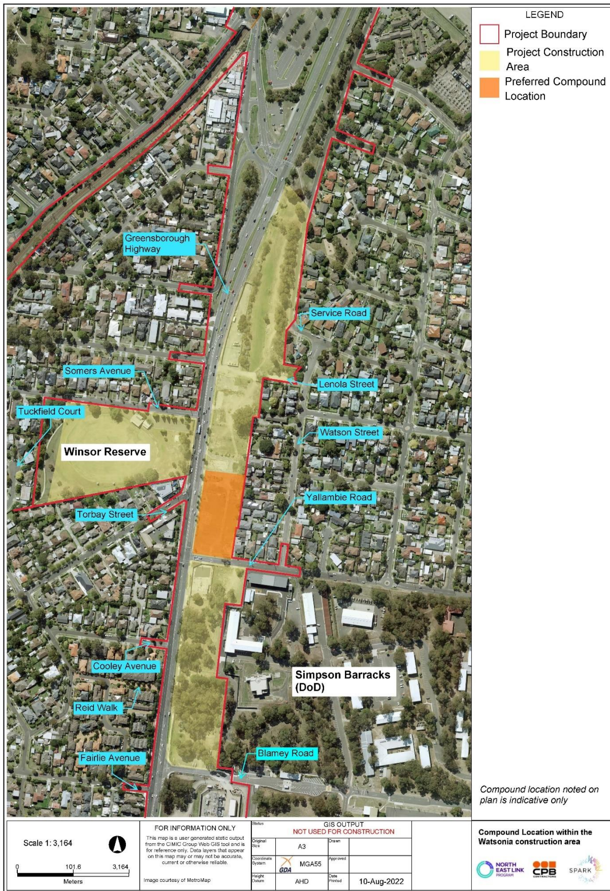
Figure 2: Preferred Compound Location and Watsonia Construction Site