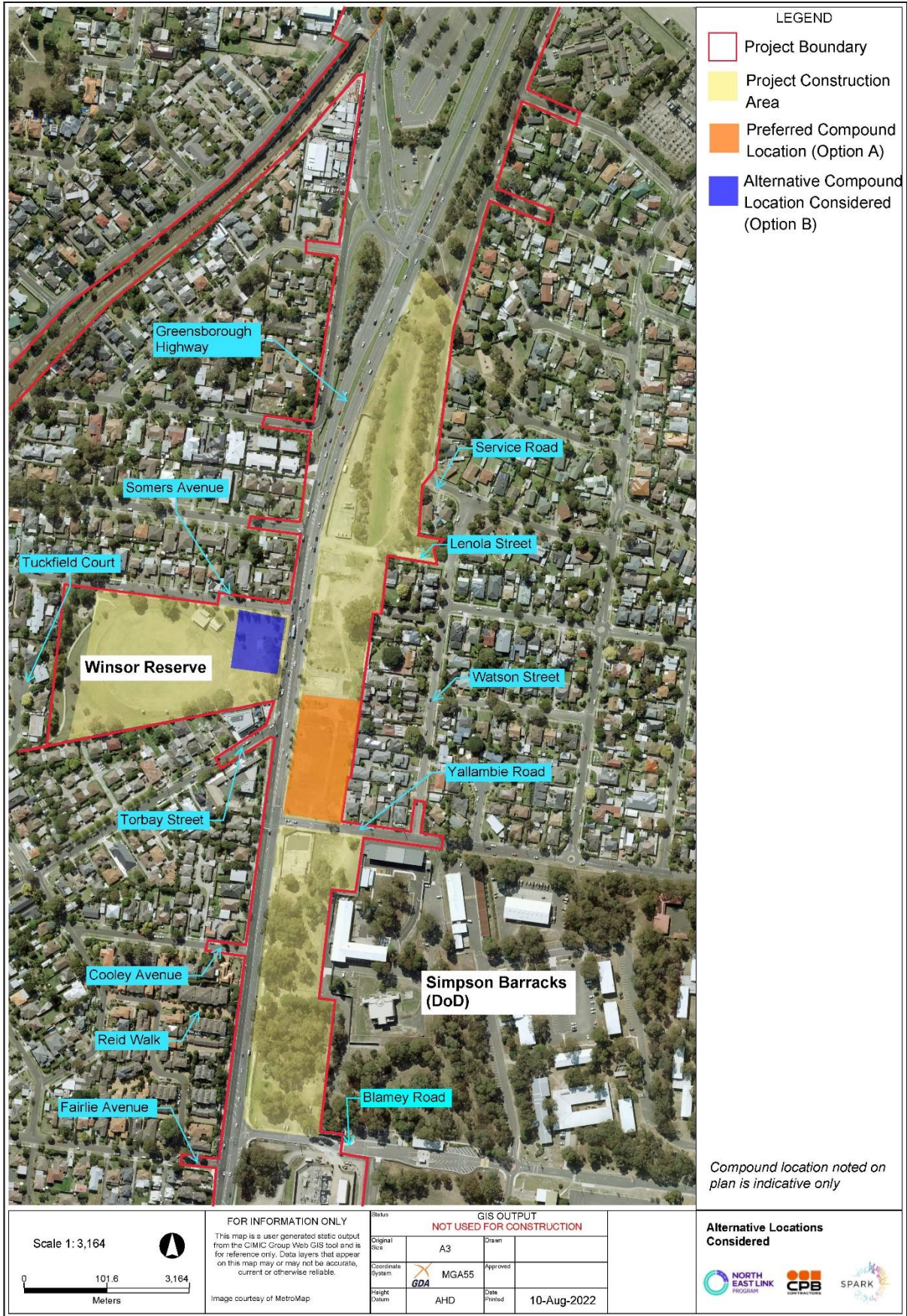
Figure 5: Considered Compound Locations