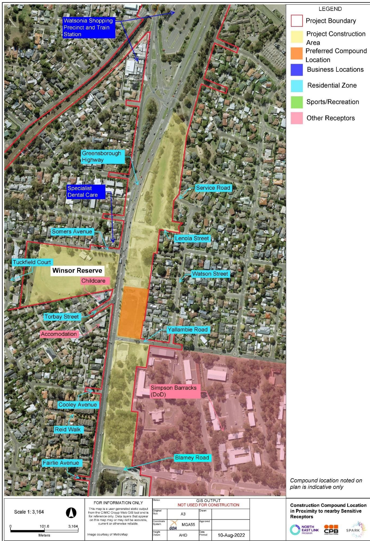
Figure 4: Preferred Compound Location and adjacent Sensitive Receptors