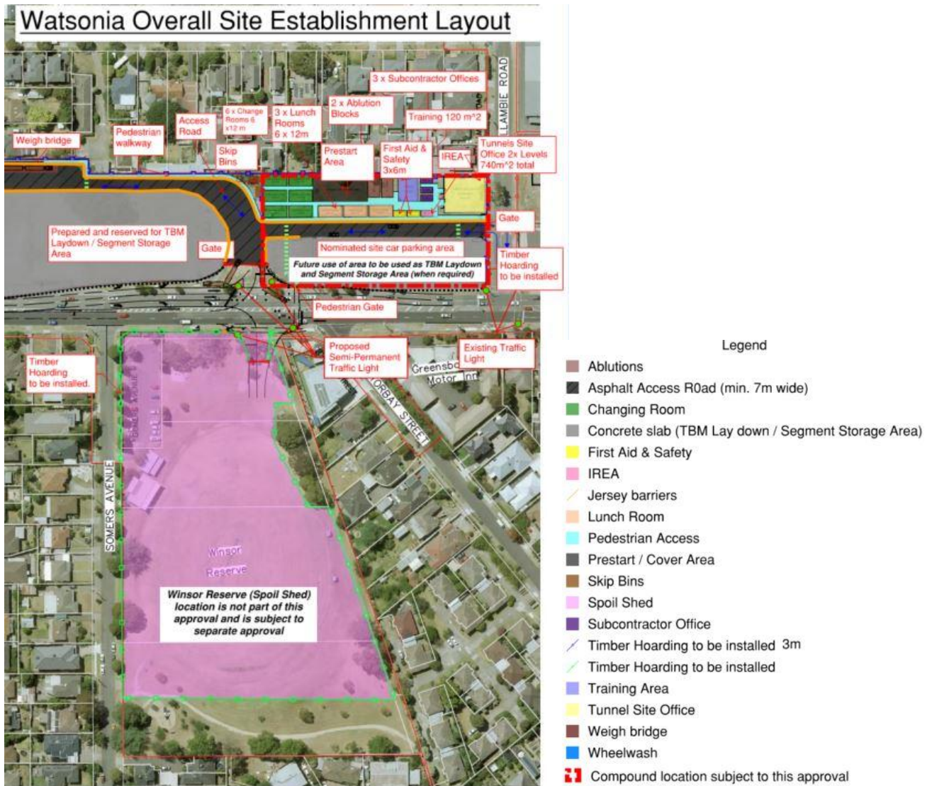
Figure 3: Indicative Compound Layout Plan

A full site layout plan showing the compound location proximity to construction site works at Watsonia is included as Appendix B to this plan.